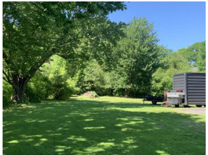
Yard in rear of property