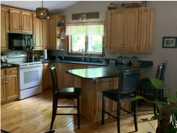
Front building residence