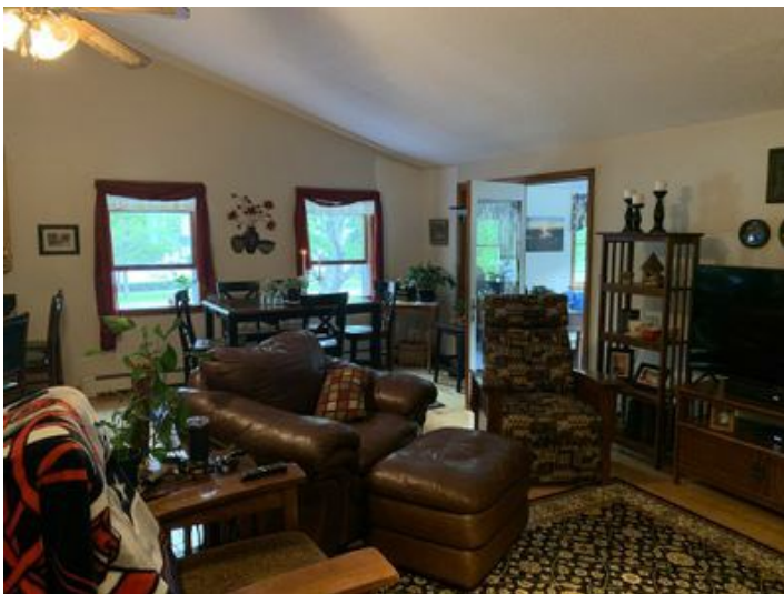
Front building residence