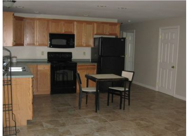
Back building residence