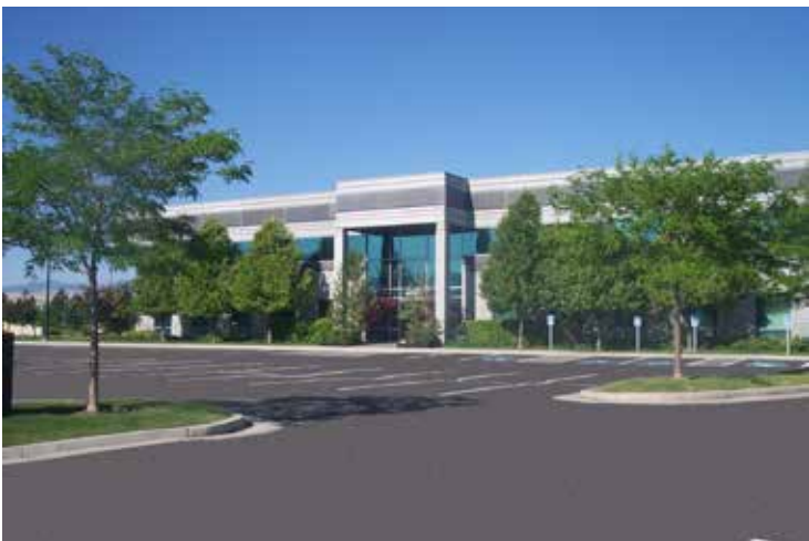
Class A Building with abundant parking