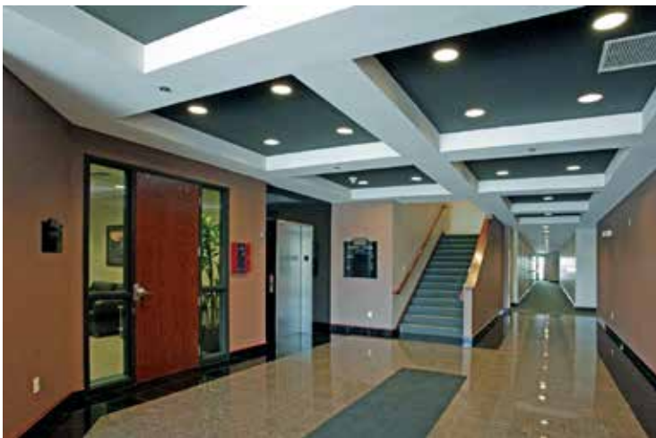
First Floor Lobby