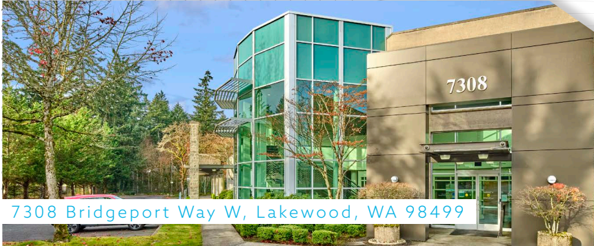
7308 Bridgeport Way W, Lakewood, WA 98499