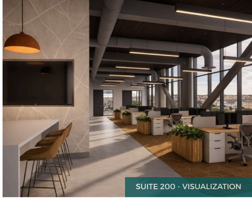
SUITE 200 - VISUALIZATION