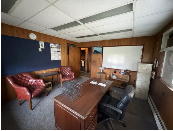
Office Suite — Main Office Detail