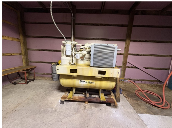
Air Compressor — Sullair Electra-Screw (Included)