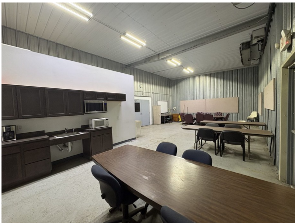
Break Room / Conference Area