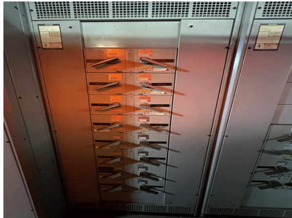
Electrical Panel — 600A West Side (800A Total)