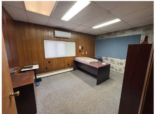
Office Suite — Private Office 2