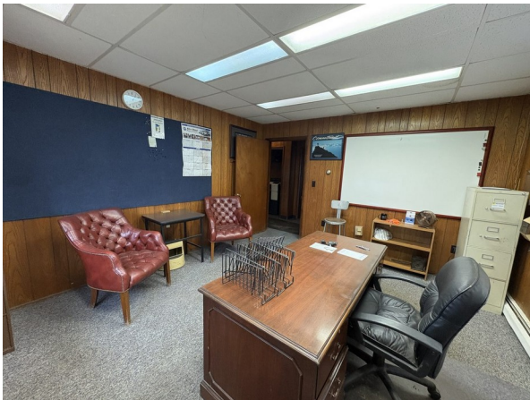
Office Suite — Main Office