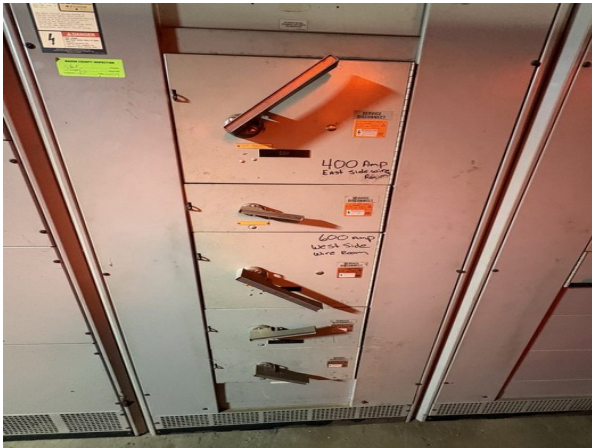
Electrical Panel — 400A East Side