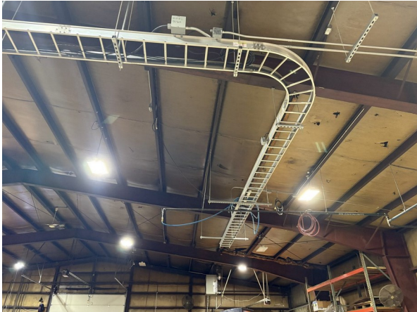
Interior — Electrical Cable Tray / Compressed Air Lines