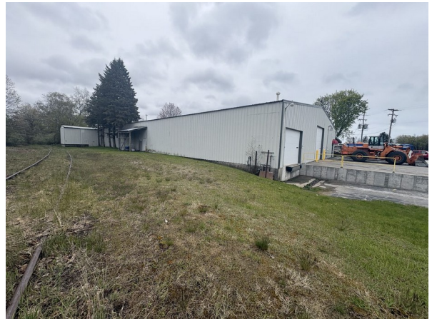
Exterior — Side View & Railroad Spur