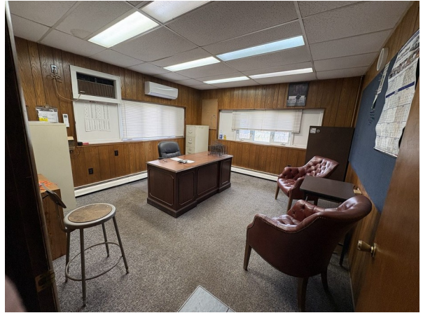
Office Suite — Private Office