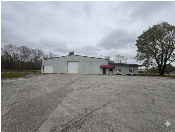
Exterior — Front Elevation & Parking