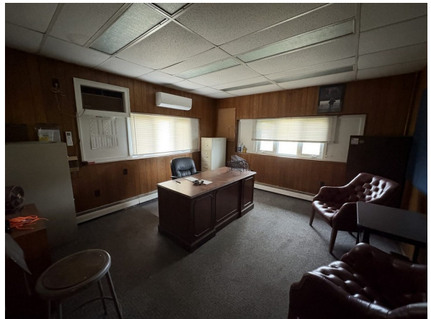
Office Suite — Overview