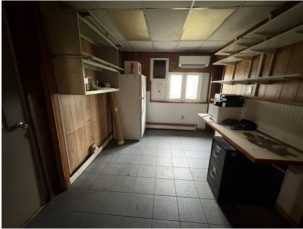
Office Suite — Break Room / Kitchen