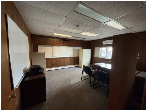
Office Suite — Office 3