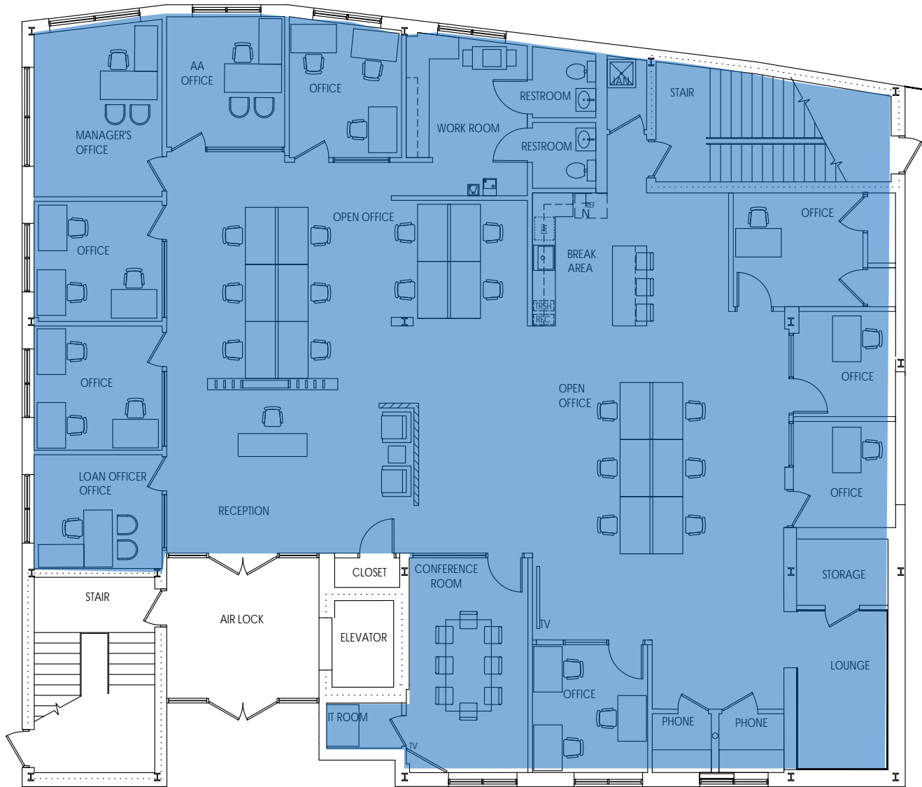
Suite 100 4,279 RSF