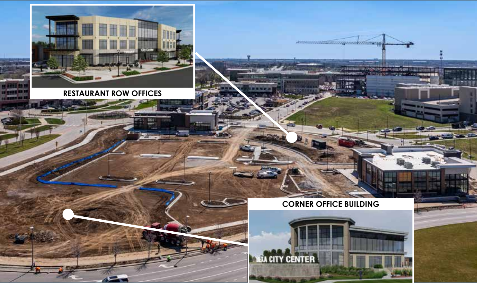
CORNER OFFICE BUILDING