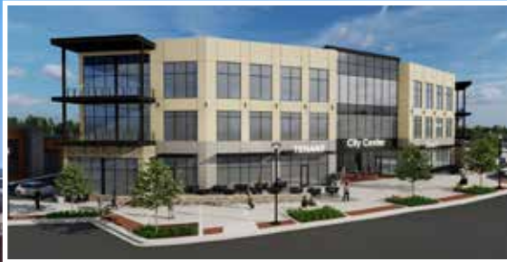
RESTAURANT ROW OFFICES