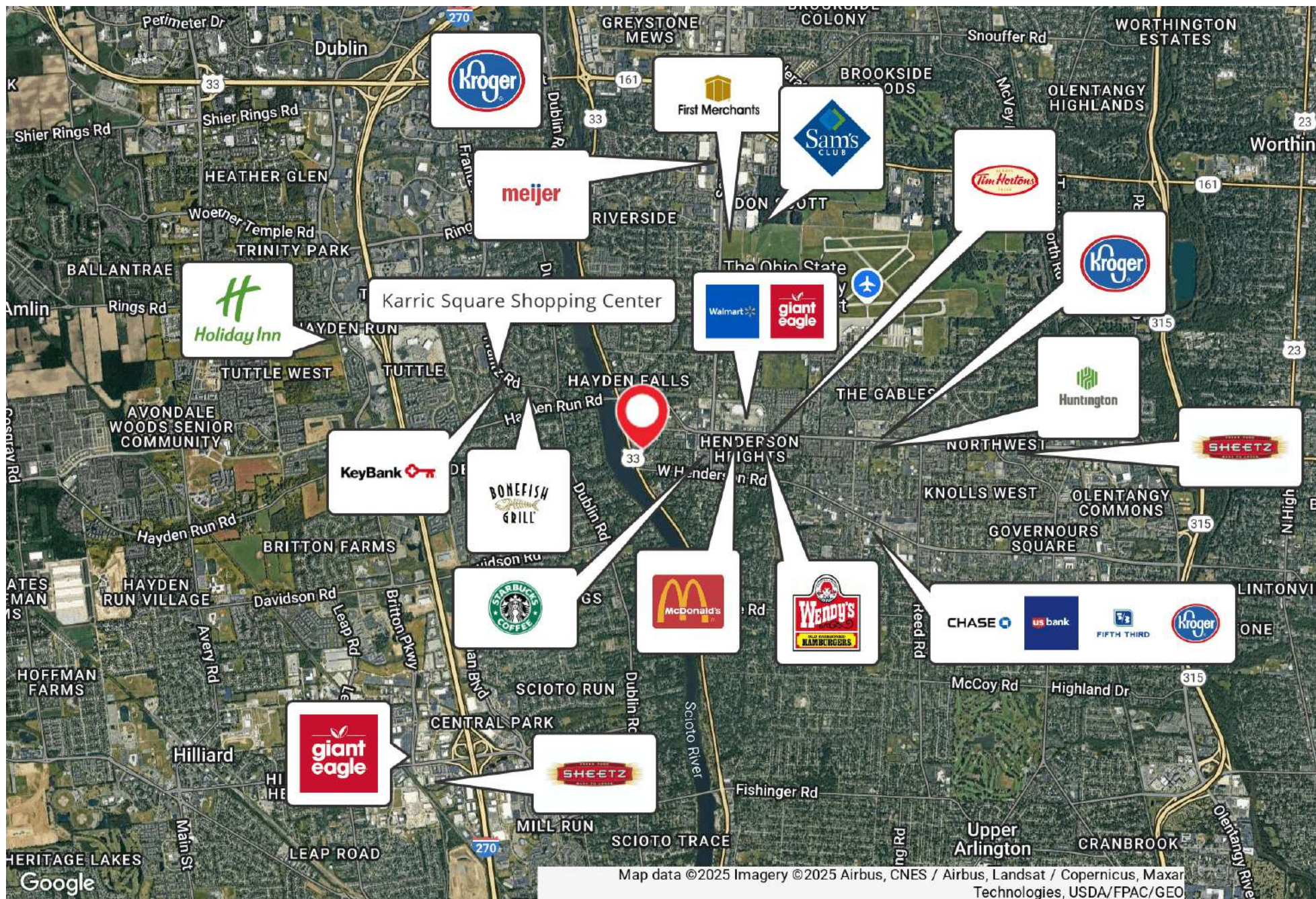
Map data ©2025 Imagery ©2025 Airbus, CNES / Airbus, Landsat / Copernicus, Maxar Technologies, USDA/FPAC/Geo