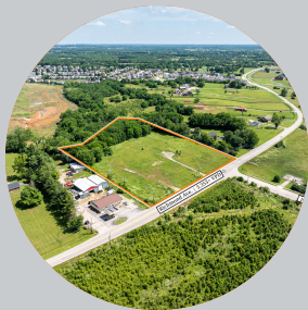
APPROVED DEVELOPMENT PLAN