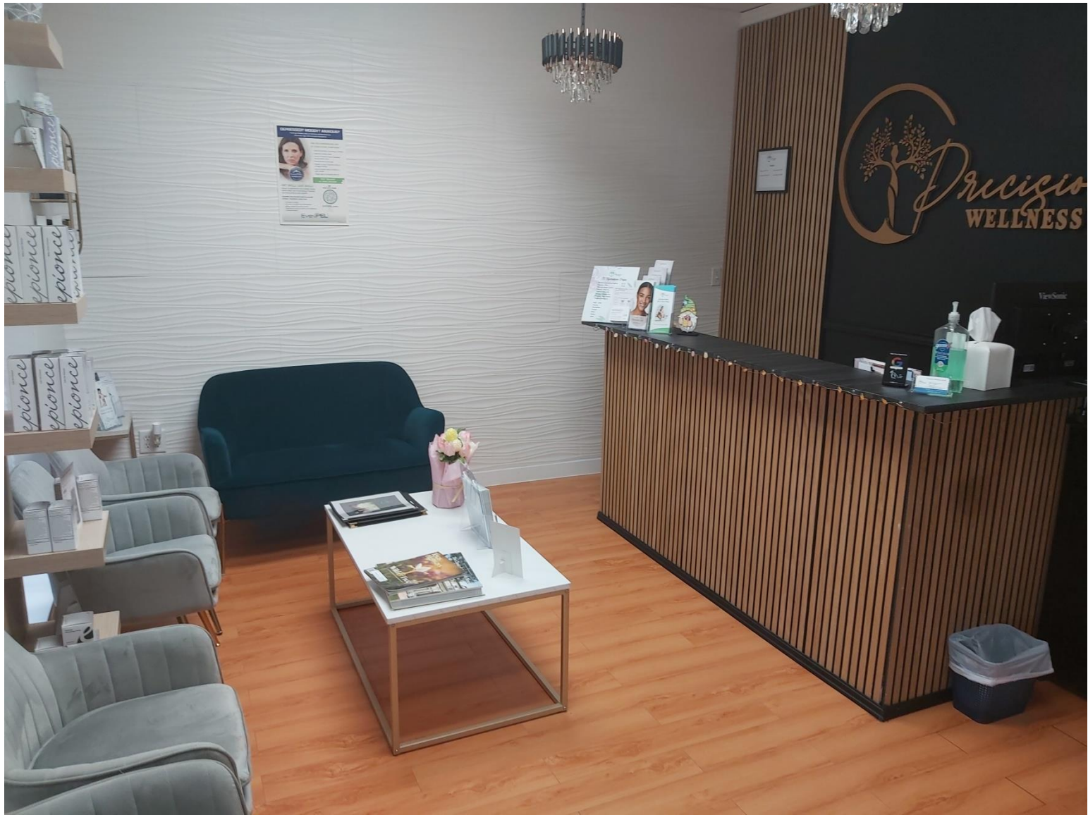
Reception view from the entrance