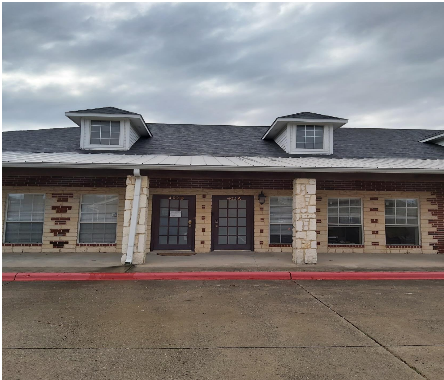
5805 Coit Rd STE 402B Plano TX 75093 (Left door in the picture)