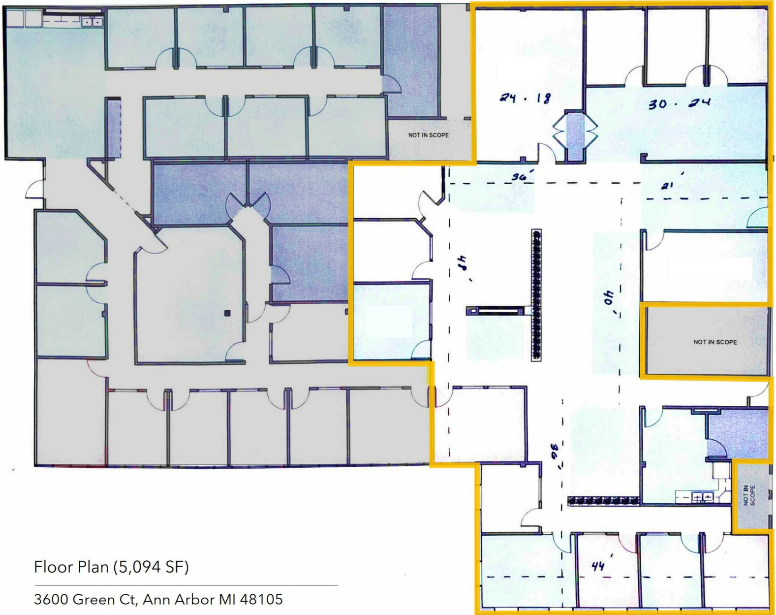
Floor Plan (5,094 SF)