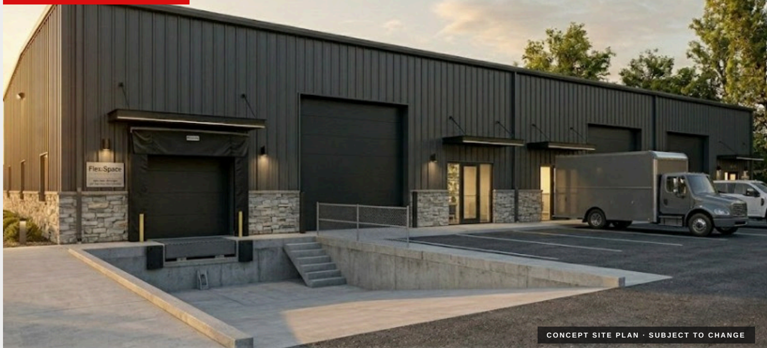
CONCEPT SITE PLAN · SUBJECT TO CHANGE

NEW FLEX DEVELOPMENT · PRE-LEASING NOW · HAMILTON, OHIO