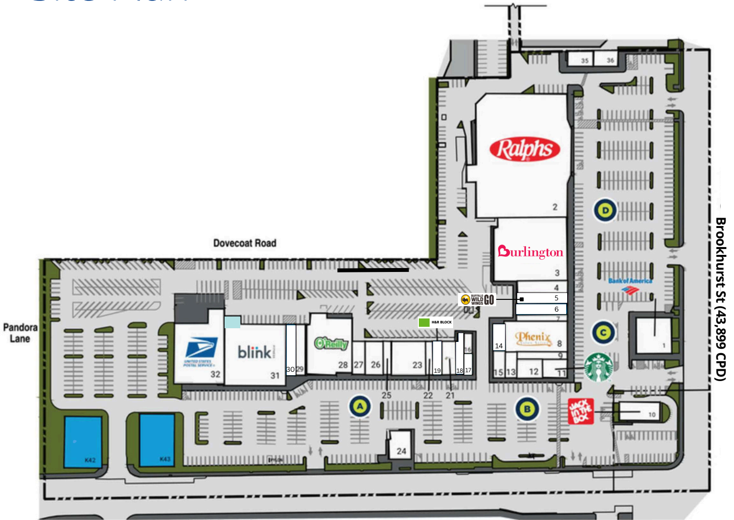
Ball Road (28,463 CPD)