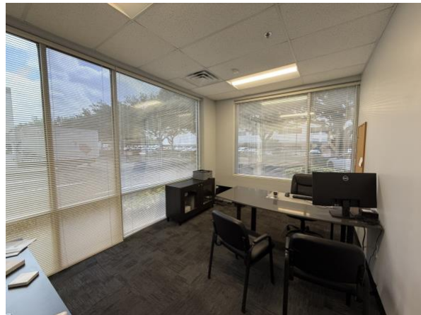
Private office with natural light