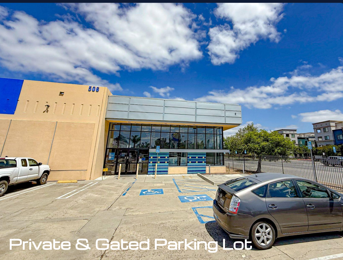
Private & Gated Parking Lot