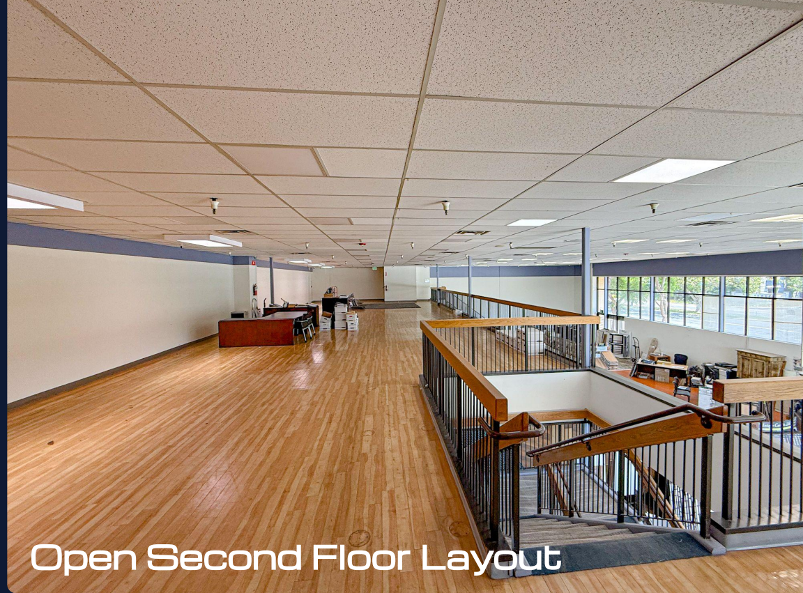
Open Second Floor Layout