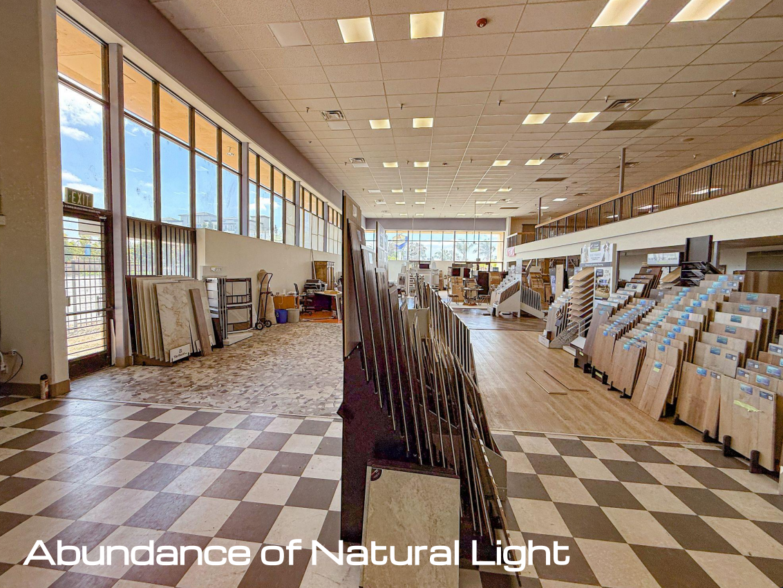
Abundance of Natural Light