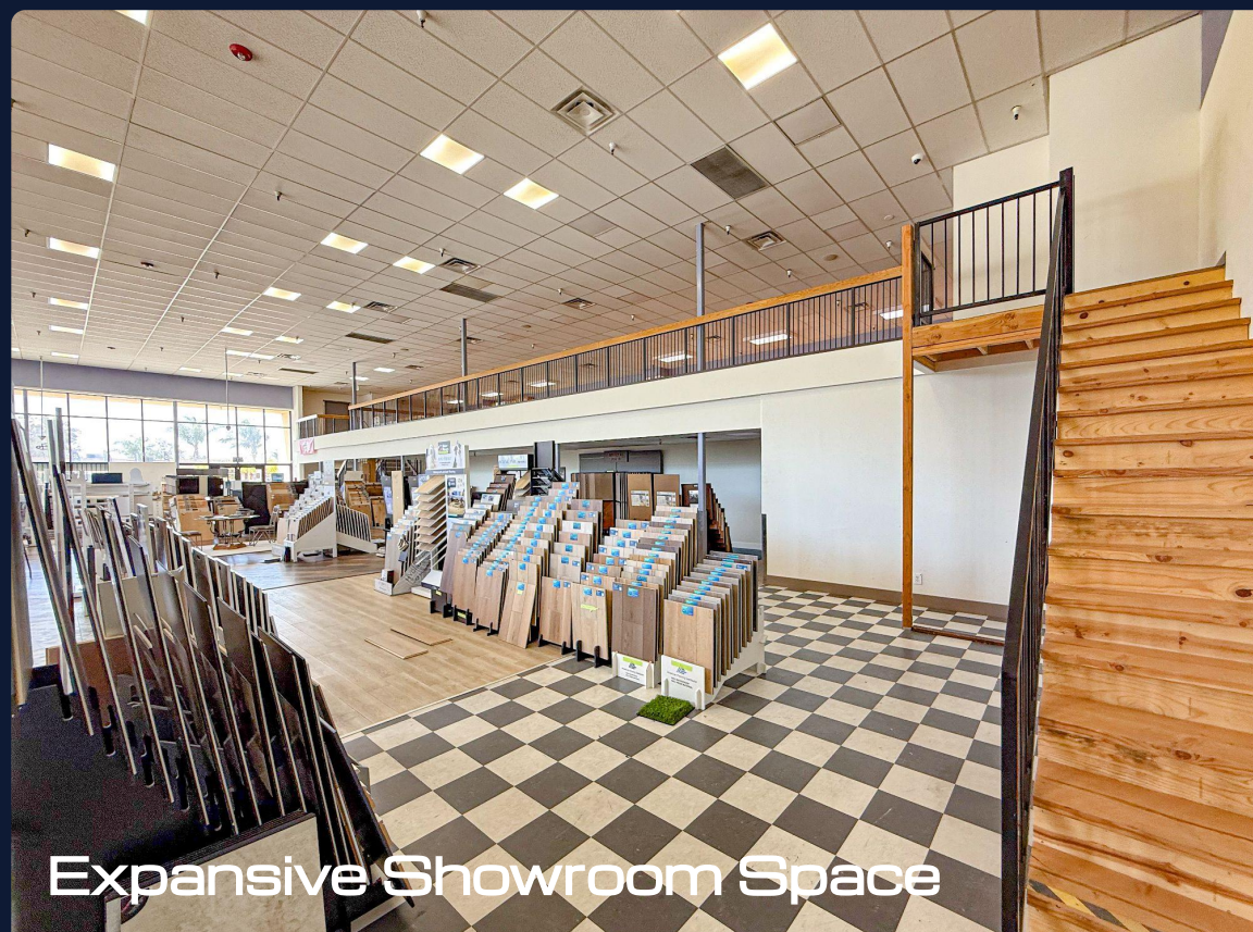
Expansive Showroom Space