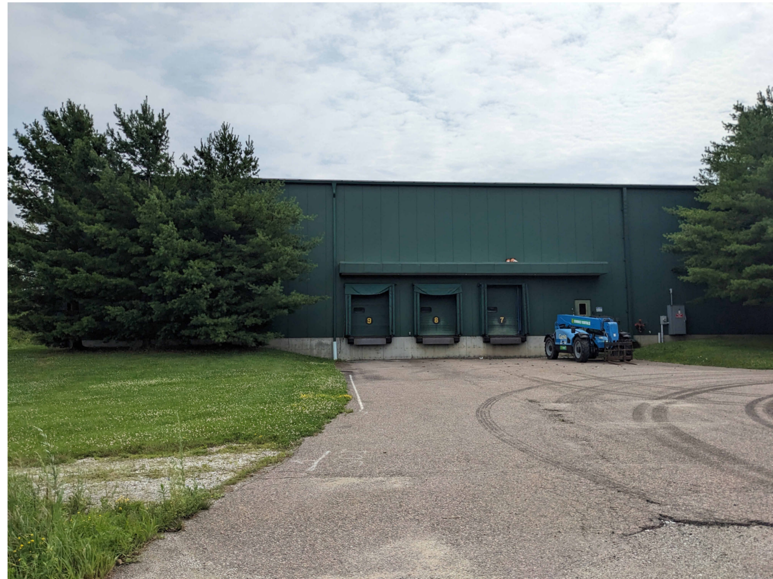
EXISTING BUILDING PHOTO - NORTH WEST CORNER