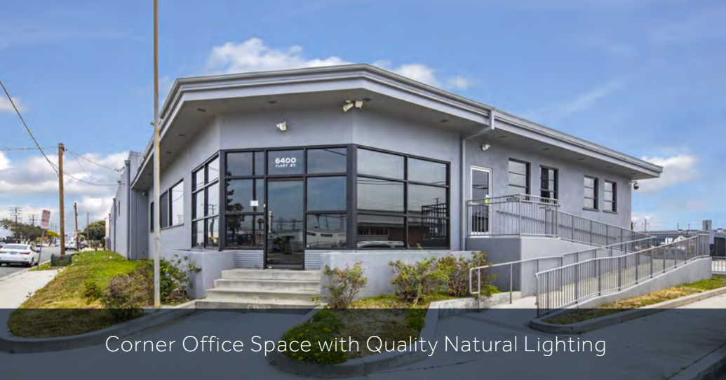
Corner Office Space with Quality Natural Lighting