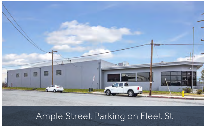
Ample Street Parking on Fleet St