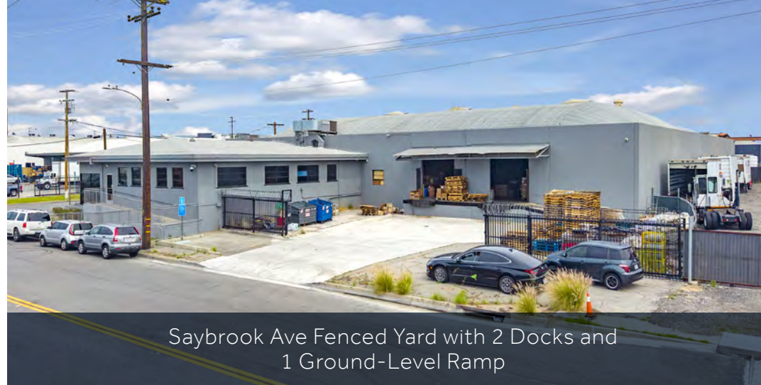
Saybrook Ave Fenced Yard with 2 Docks and 1 Ground-Level Ramp