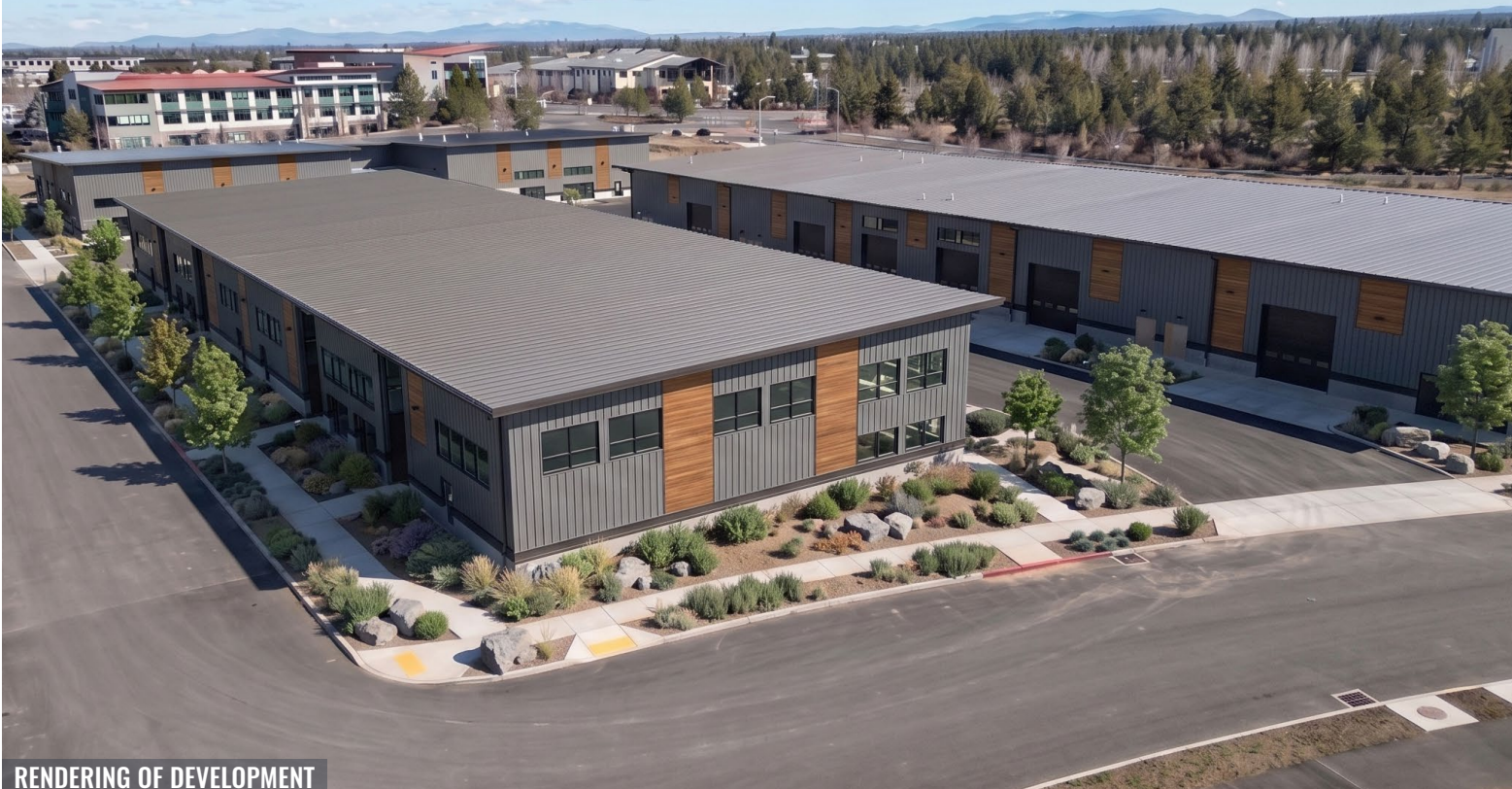
RENDERING OF DEVELOPMENT

NEW CONSTRUCTION | HIGH QUALITY BEND INDUSTRIAL