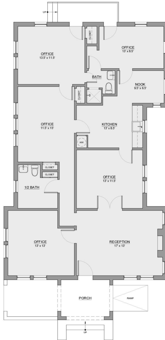
2216 COLLEGE AVE. SCALE: 1/8" = 1'