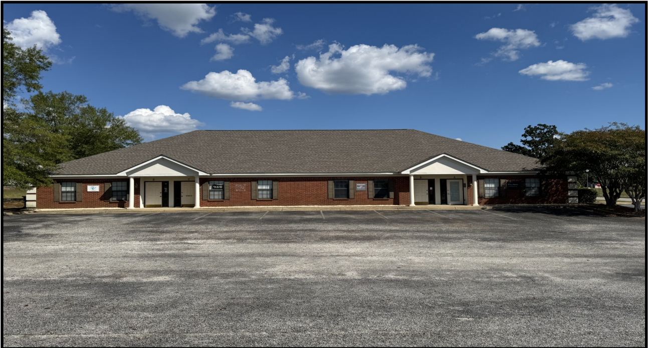
Meriwether Commercial Real Estate, LLC an Equal Opportunity Company. The information contained herein is from sources deemed reliable. No representation is made to the accuracy herein.

Lease Price: $1,350.00/month Premises: +/- 1,250 S.F. Lease Term: 3 year Zoning: B-2 Accessibility: Excellent Parking: On Site