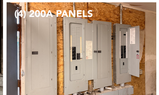
(4) 200A PANELS