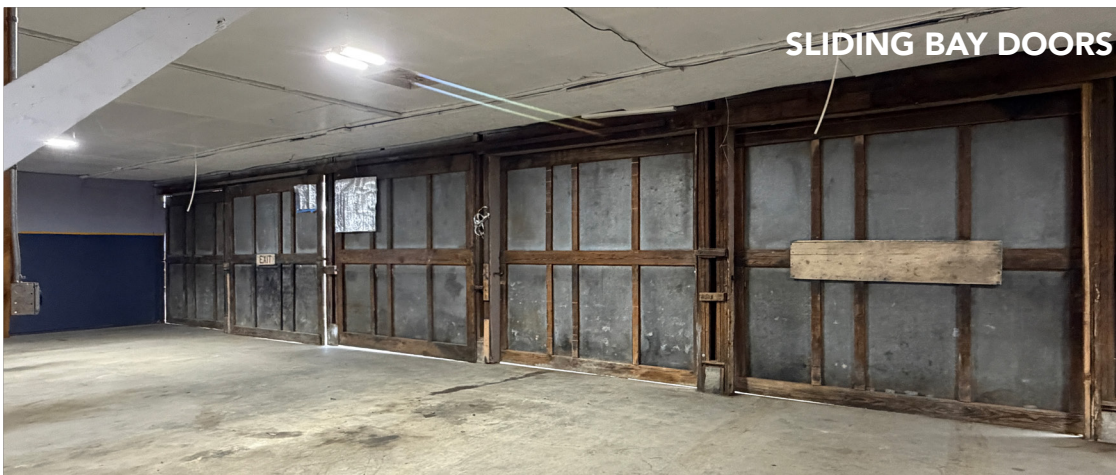
SLIDING BAY DOORS