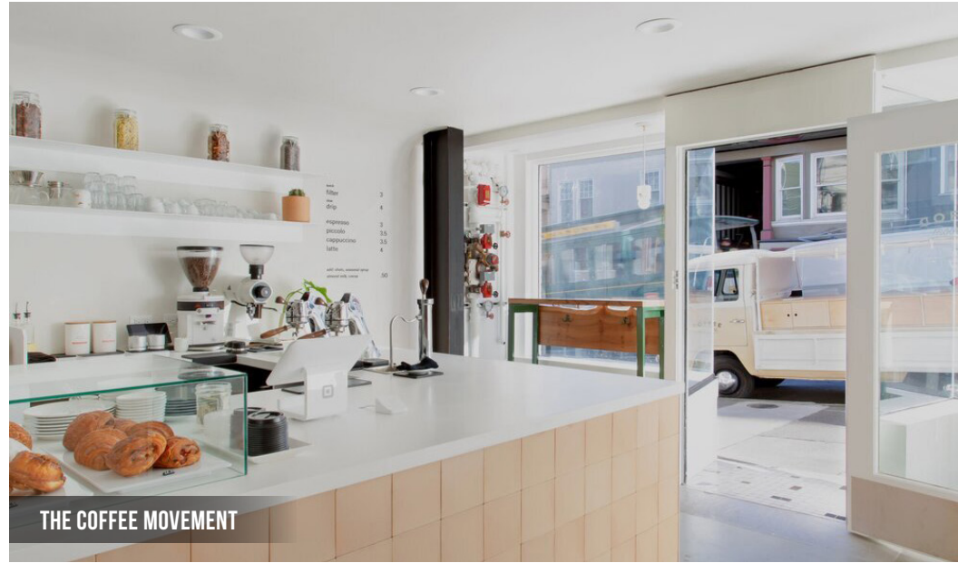
THE COFFEE MOVEMENT