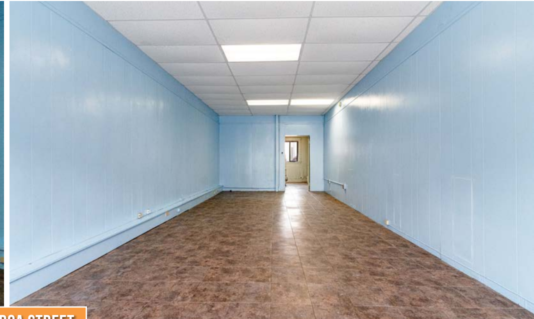
1614 BALBOA STREET