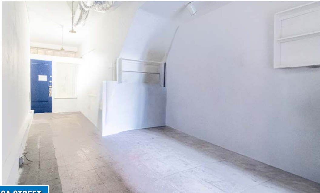
1616 BALBOA STREET