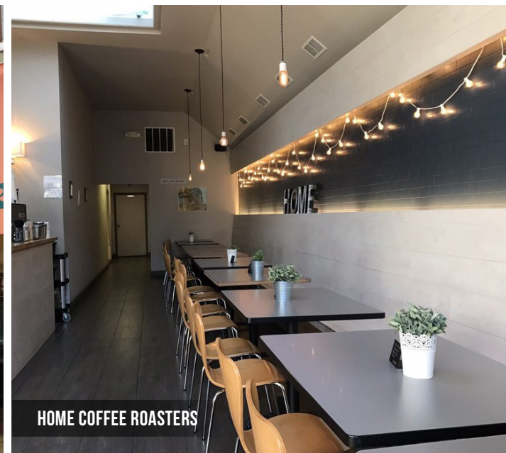
HOME COFFEE ROASTERS