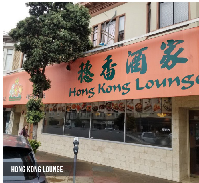
HONG KONG LOUNGE