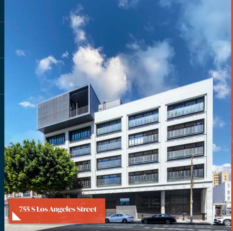
755 S Los Angeles Street