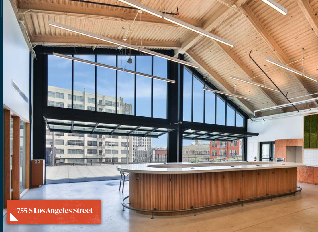
755 S Los Angeles Street

700 S Main Street is a fully vacant, four-story creative office building totaling 132,408 SF. Formerly the Dearden's department store, the property was fully renovated in 2022 and now features exposed wood timbers, original brick walls, upgraded operable windows, and 27 skylights on the top floor. The ground floor offers the potential for two full-service restaurants, as well as additional in-line retail along Main Street and 7th Street. The building also features a basement that provides additional storage and includes a 4,000 SF speakeasy space with private access.