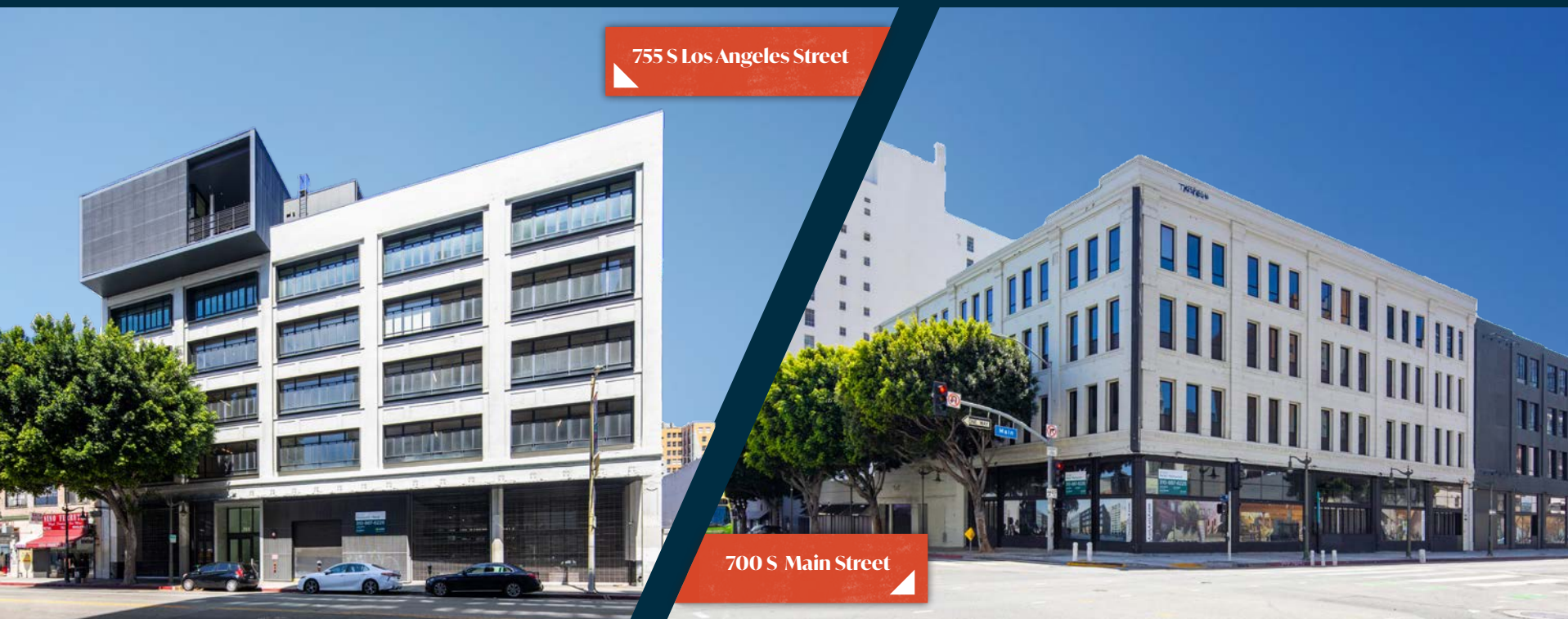
755 S Los Angeles Street

With up to 150 Parking Stalls via Perpetual Parking Easement at Adjacent Property