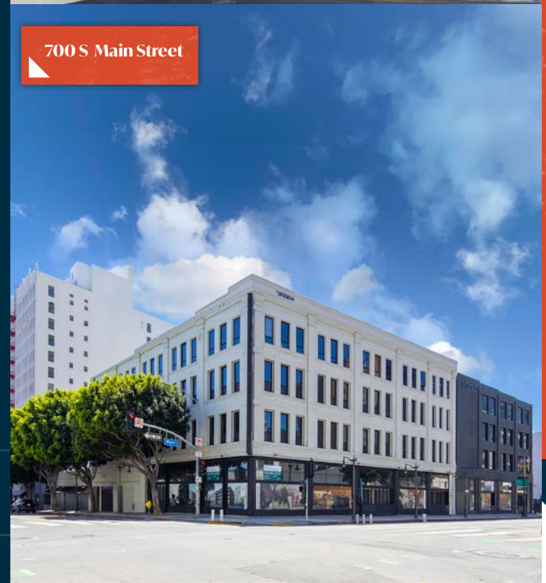
700 S Main Street