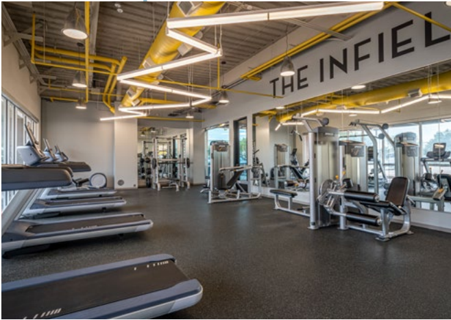
STATE-OF-THE-ART FITNESS CENTER