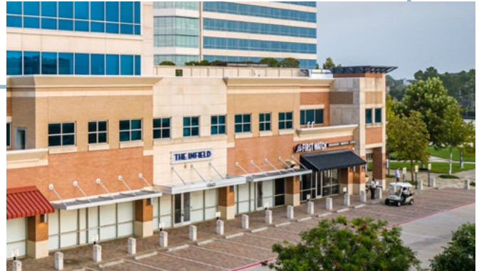
ON-SITE EATERY WITH CATERING OPTIONS