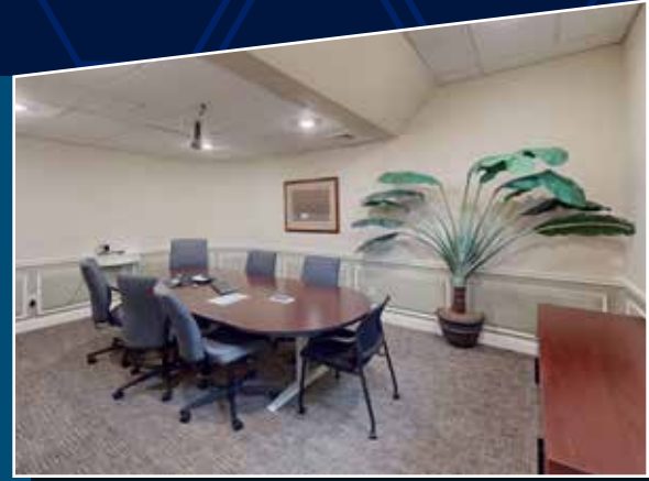
Suite 21 & 22