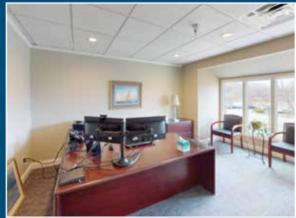
Suite 21 & 22