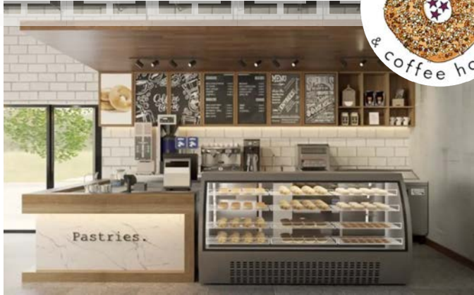
BENJI'S BAGEL + COFFEE HOUSE