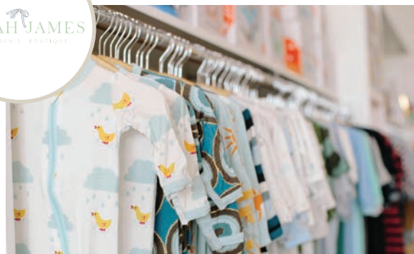
SELAH JAMES CHILDREN'S BOUTIQUE