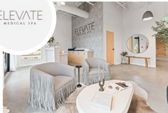
ELEVATE MED SPA