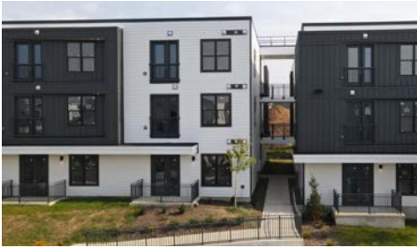
ARCADE AT THE ANNEX