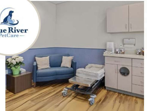
BLUE RIVER PETCARE