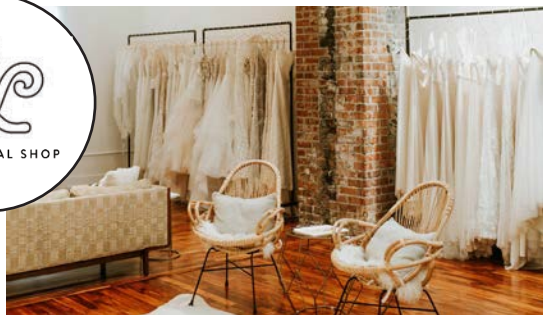
A & BÉ BRIDAL