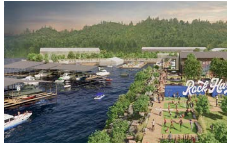
ROCK HARBOR MARINA