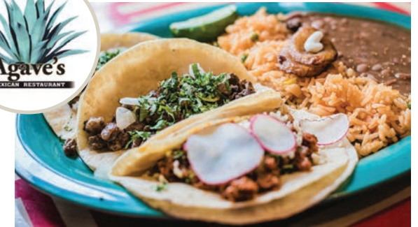
AGAVE'S MEXICAN RESTAURANT