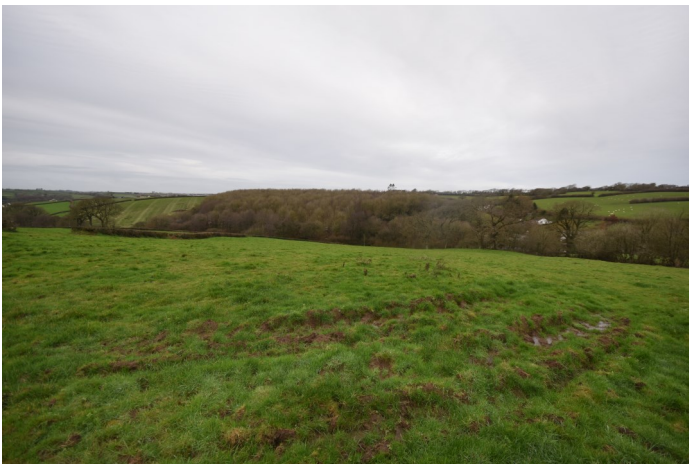
Land Facing North