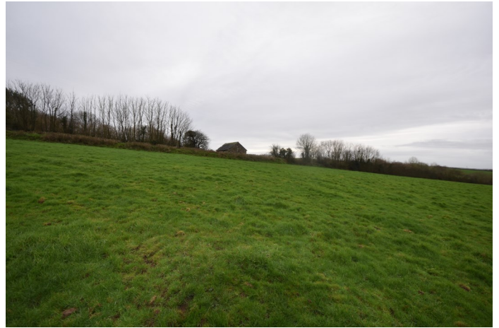
Land Facing South