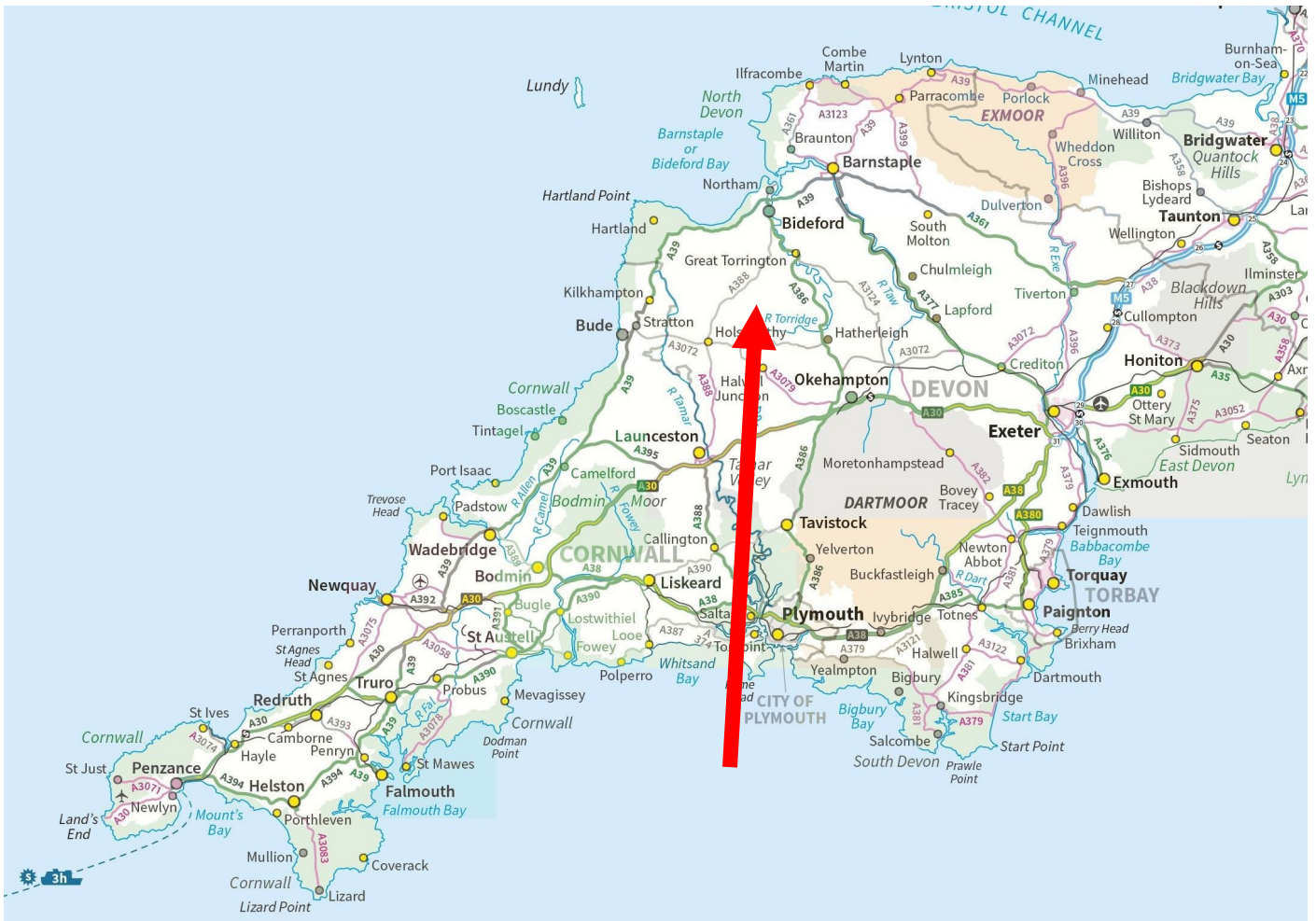
Red arrow locating Shebbear, Devon