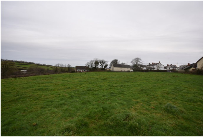
Land Facing East