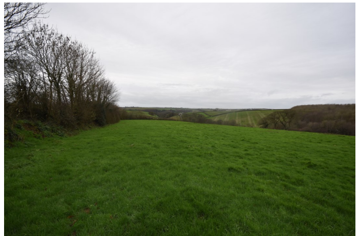
Land Facing West