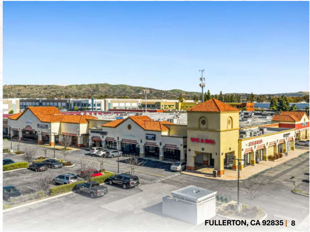
FULLERTON, CA 92835 | 8