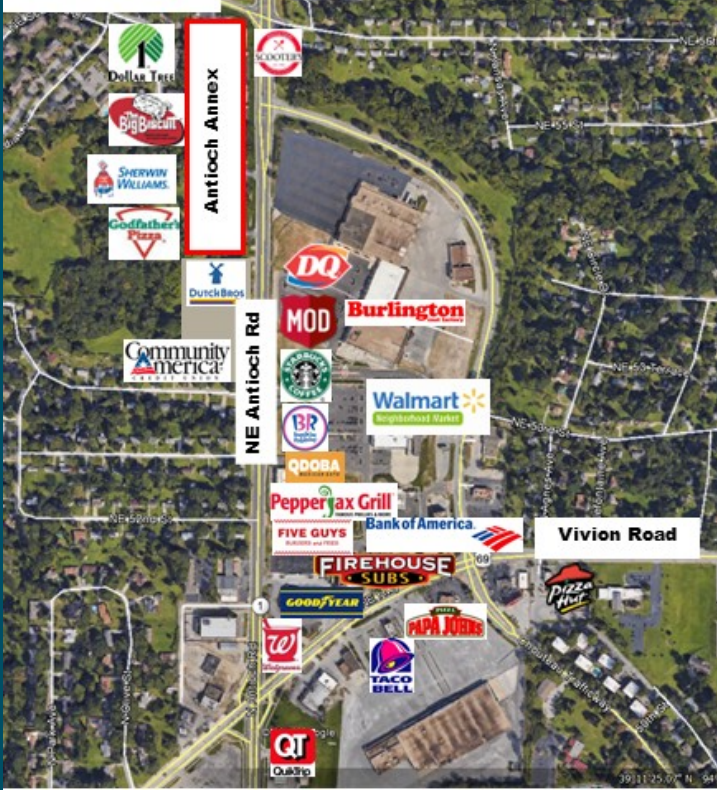
NE Englewood Road

Median Home Value 1-mile: $166,973 3-mile: $179,936 5-mile: $199,621