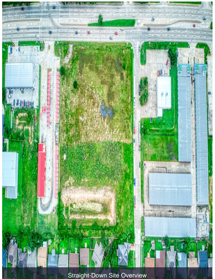
Straight-Down Site Overview