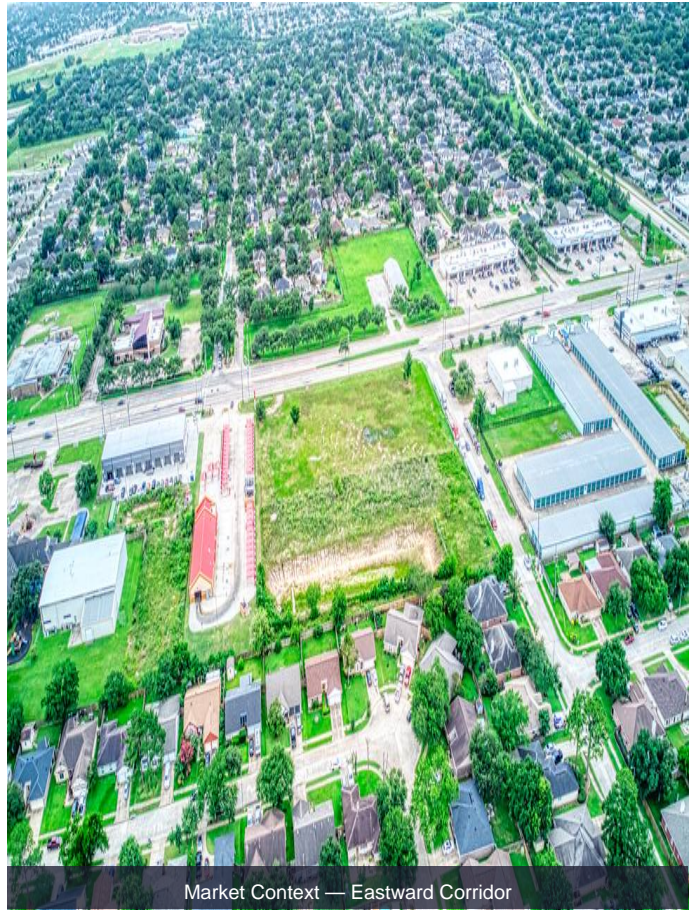
Market Context — Eastward Corridor