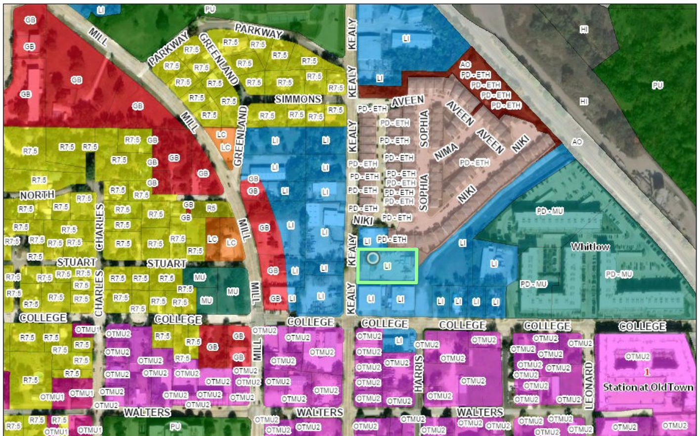
414 N. Kealy Ave - Zoning Map