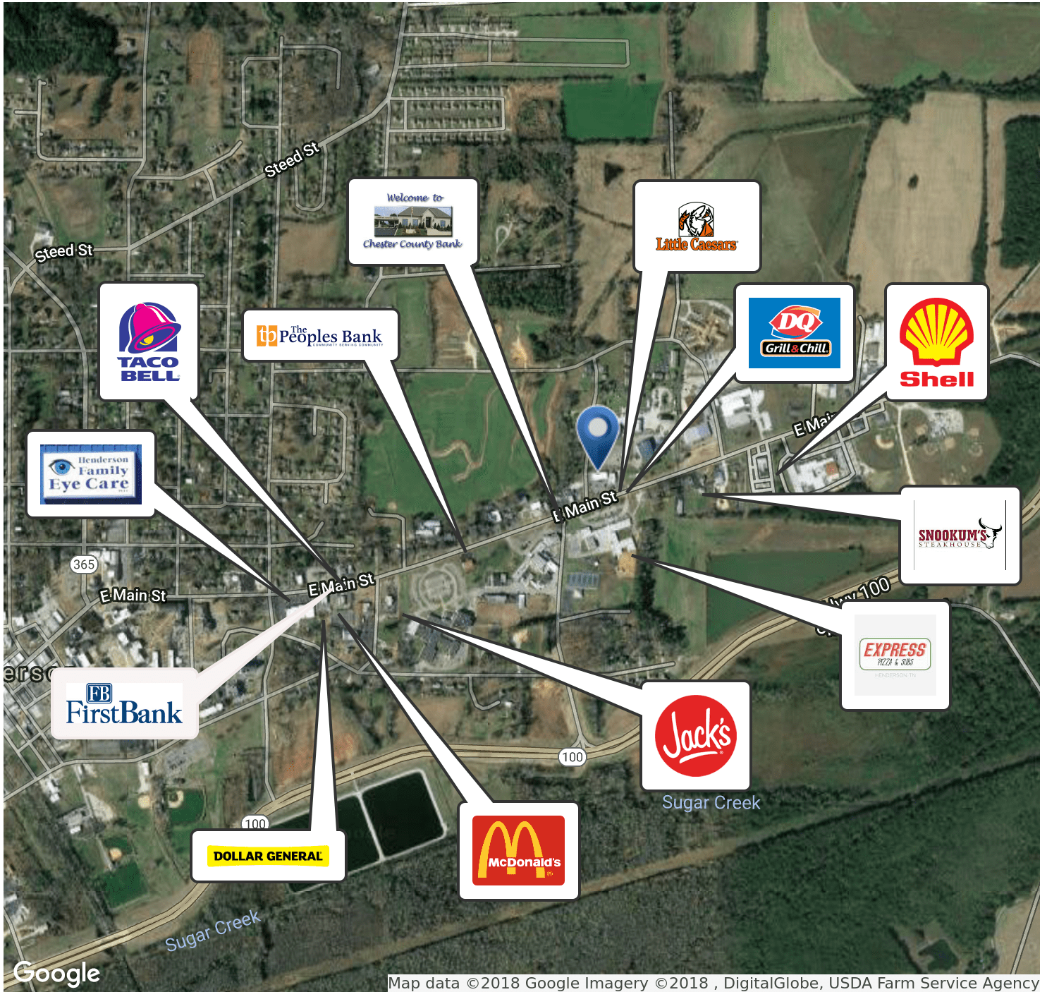
Map data ©2018 Google Imagery ©2018 , DigitalGlobe, USDA Farm Service Agency

715 East Main Street, Henderson, TN 38340