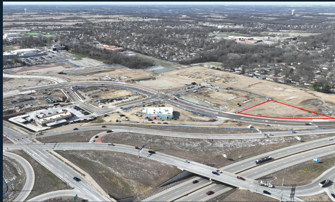
INTERSECTION VIEW Looking north — HWY 50 & HWY 291 interchange