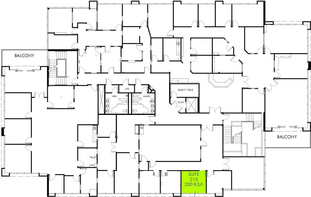
Suite #213 (250 RSF)