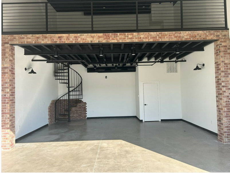
Custom designed mezzanine, polished concrete flooring