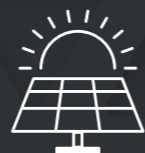
SOLAR PV 312 PANELS