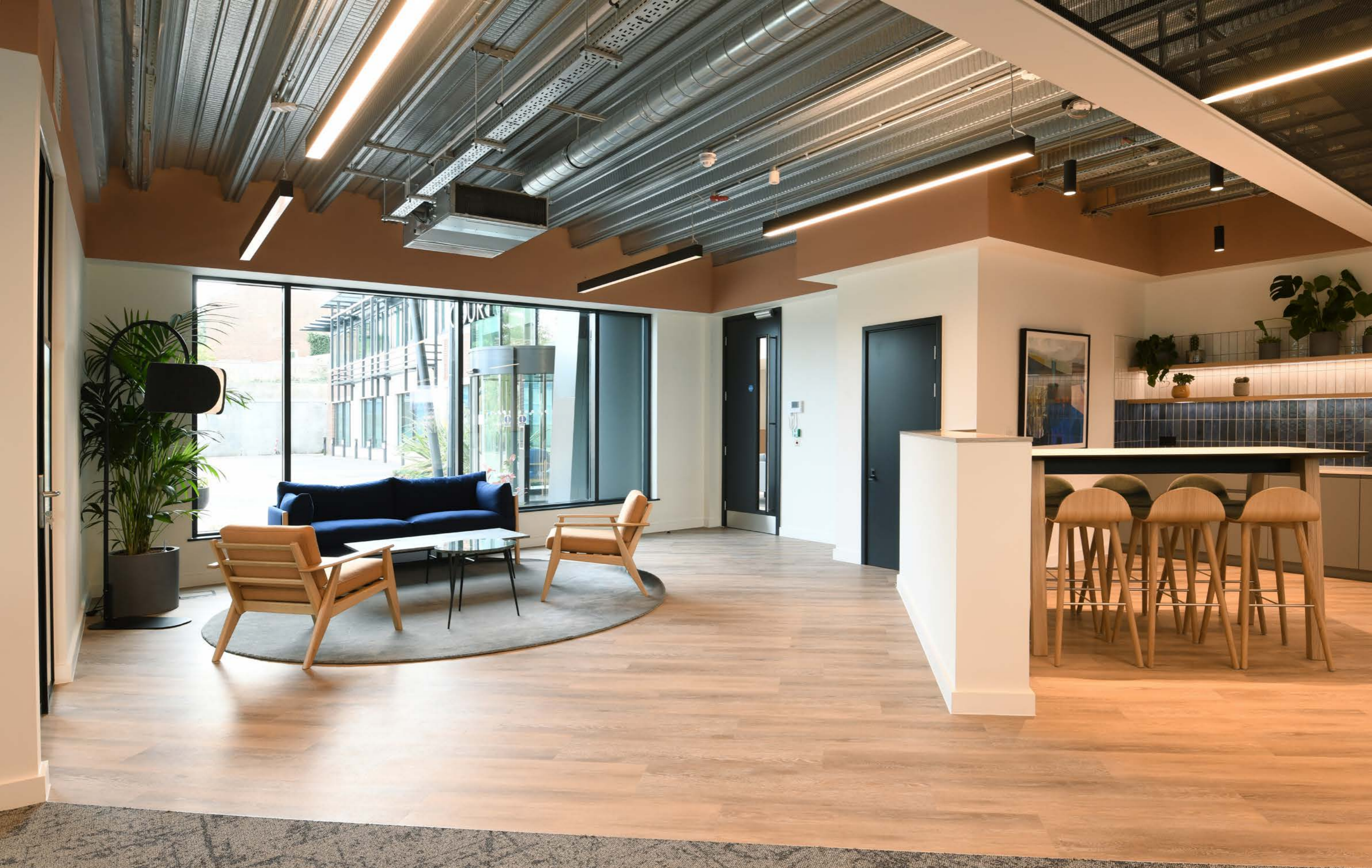
Ground floor – example fit out