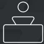
NEWLY REFURBISHED DOUBLE STOREY RECEPTION