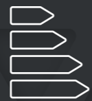
EPC TO BE REASSESSED