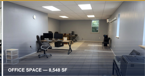
OFFICE SPACE — 8,548 SF