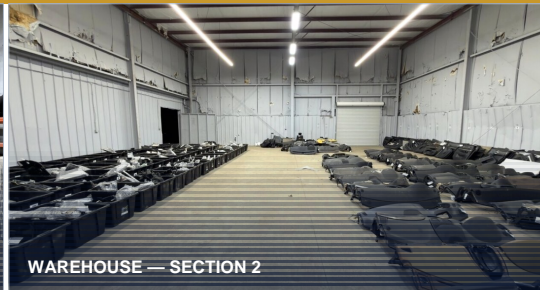
WAREHOUSE — SECTION 2