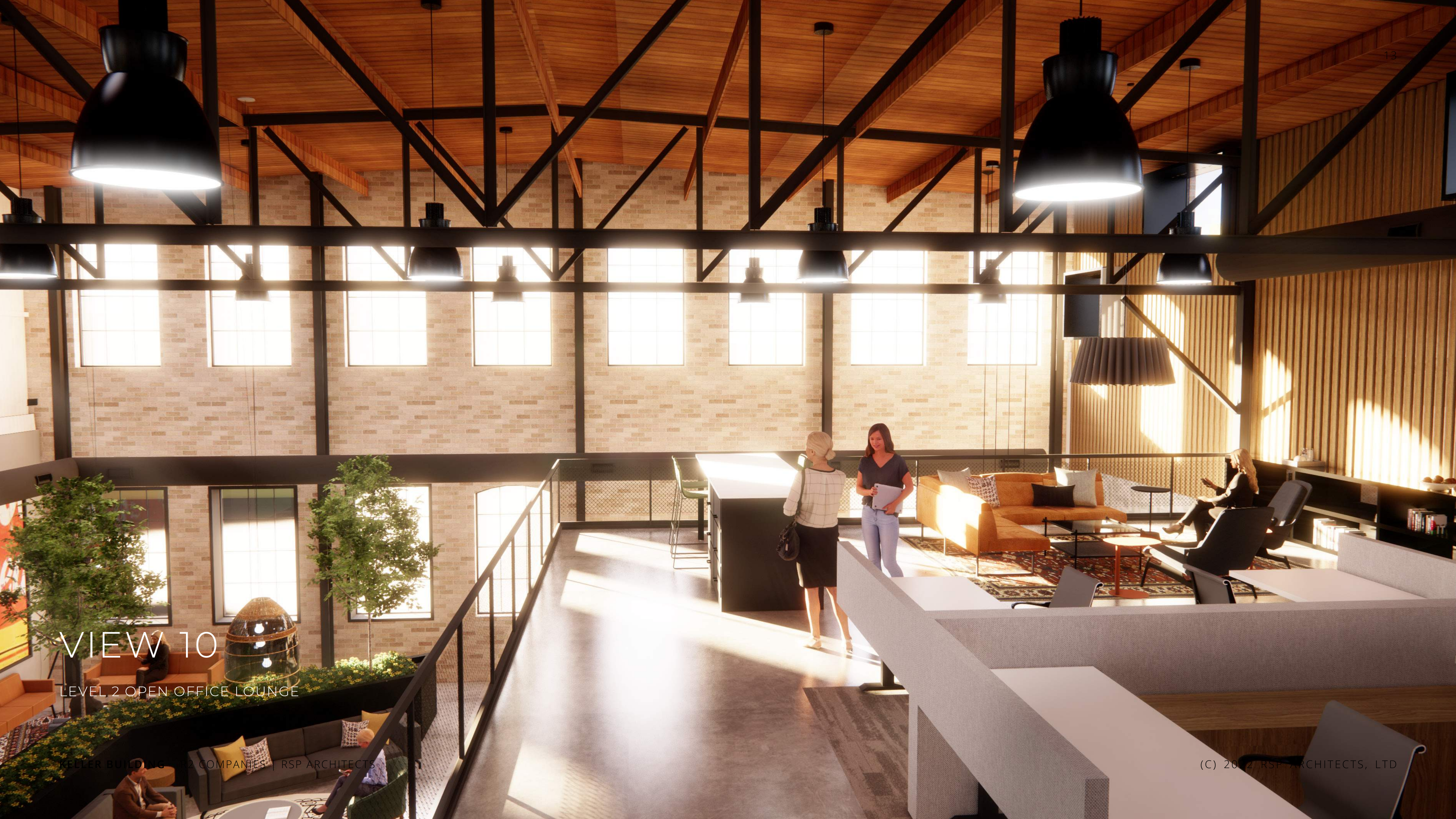
VIEW 10 LEVEL 2 OPEN OFFICE LOUNGE