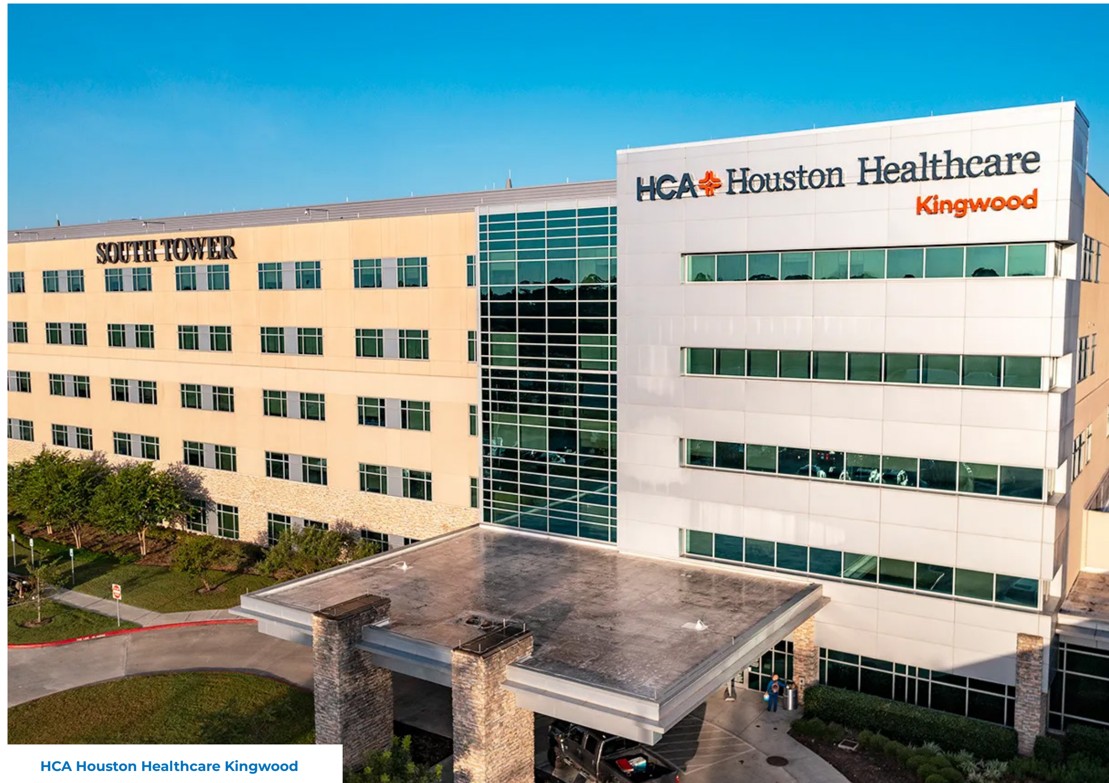
HCA Houston Healthcare Kingwood

Kingwood is a master-planned community known as the “Livable Forest” for its lush, wooded landscape and commitment to preserving nature. The community features more than 75 miles of greenbelt trails, connecting neighborhoods to parks, schools, and shopping centers, making it ideal for walking, biking, and outdoor recreation. Kingwood is a vibrant and family-friendly area that balances tranquility with convenience. Its proximity to Lake Houston and major highways also makes it a desirable location for both residents and businesses.