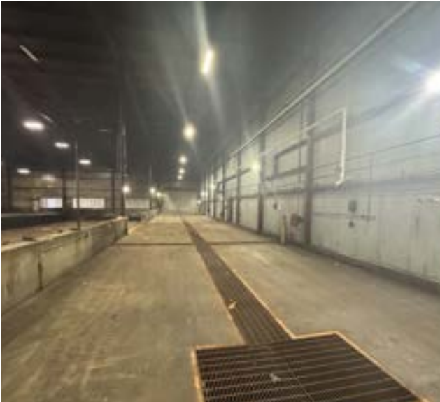
Drive through bay