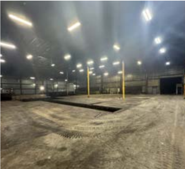
Main Production Area