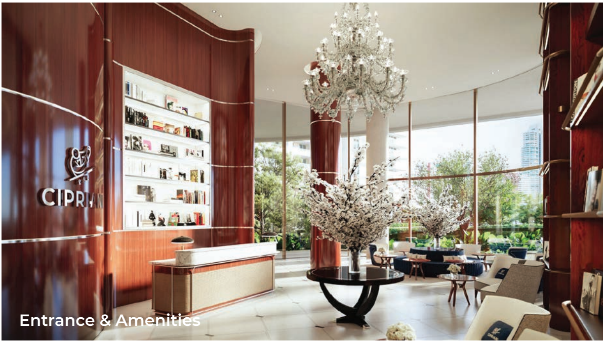
Entrance & Amenities