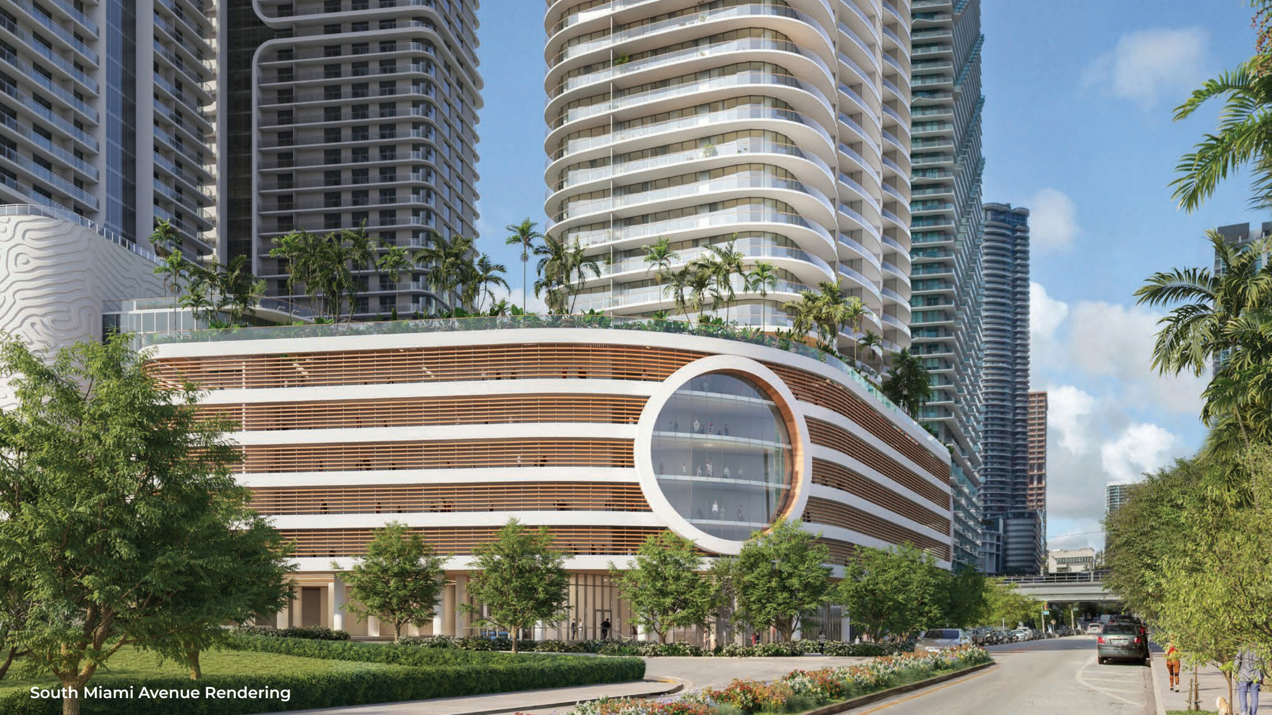
South Miami Avenue Rendering