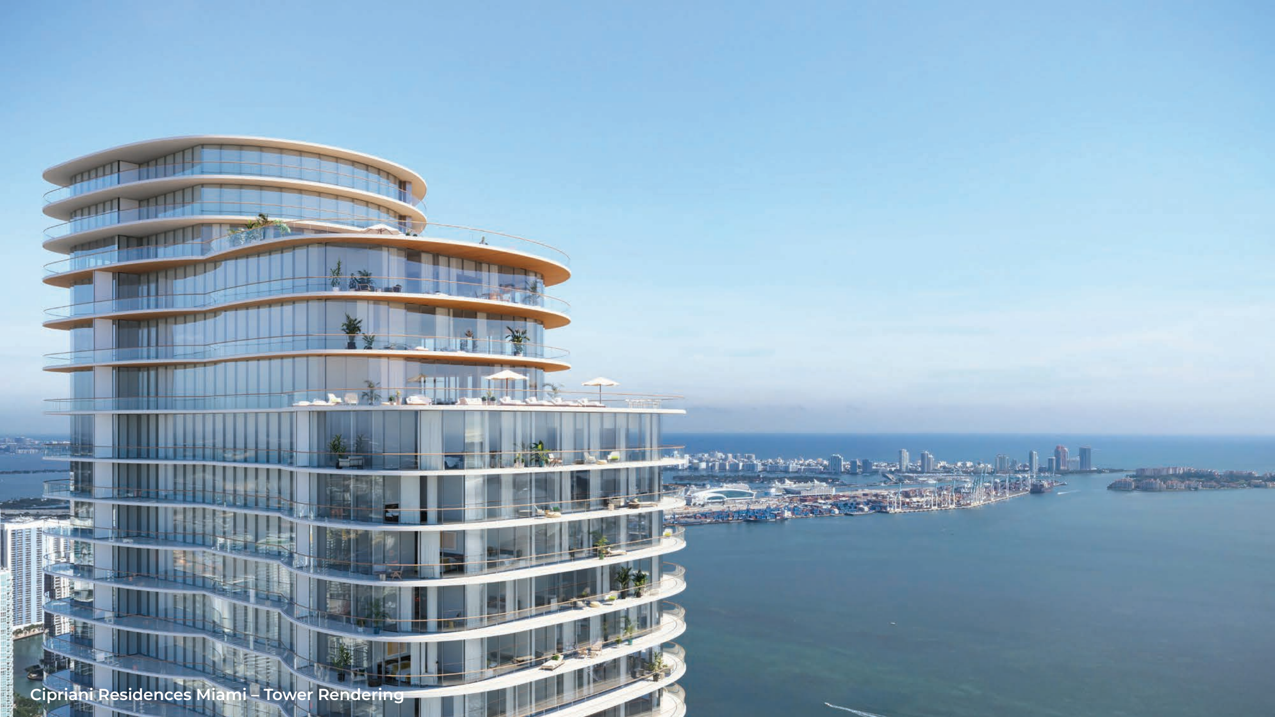
Cipriani Residences Miami – Tower Rendering