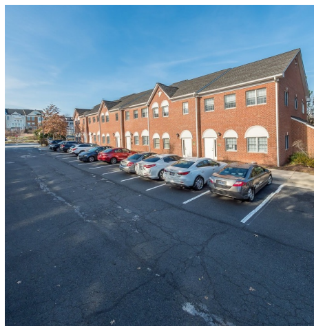
Parking & Building