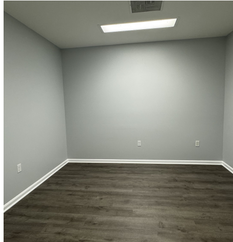
Office Room — Fresh Paint