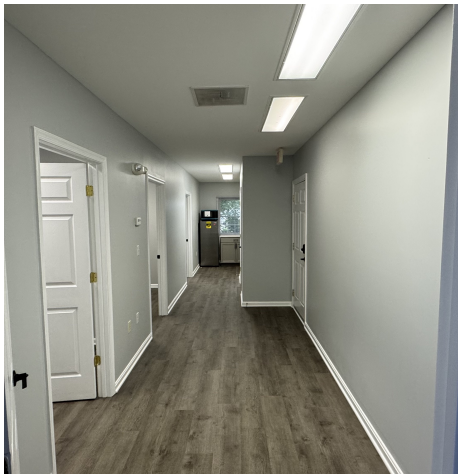
Hallway — New Flooring