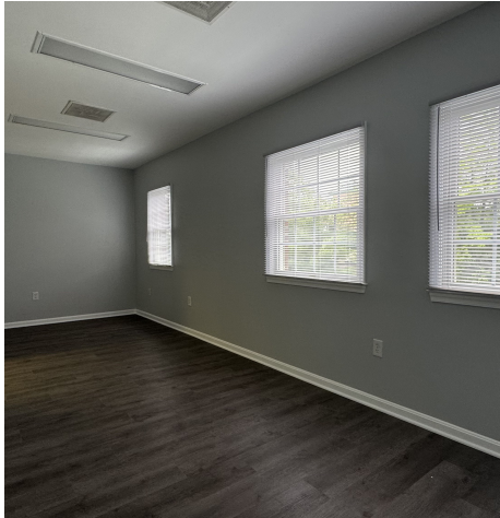
Office Room — Natural Light