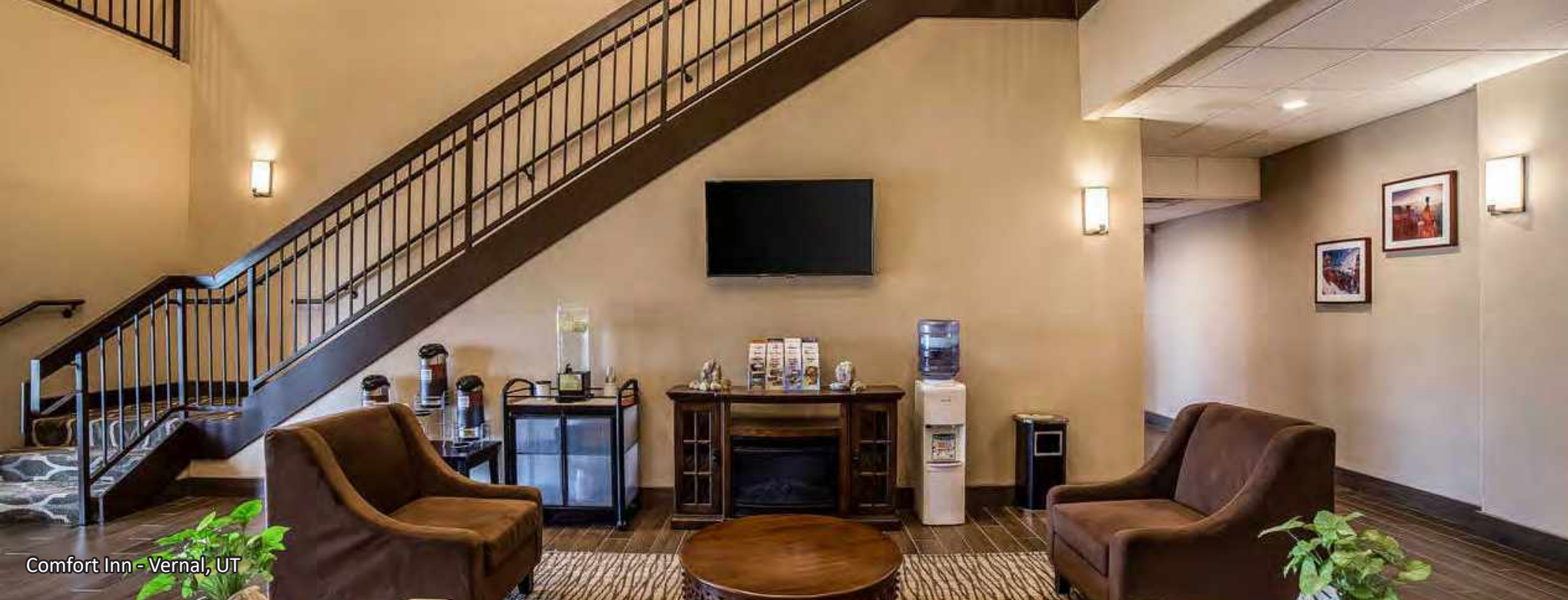
Comfort Inn - Vernal, UT