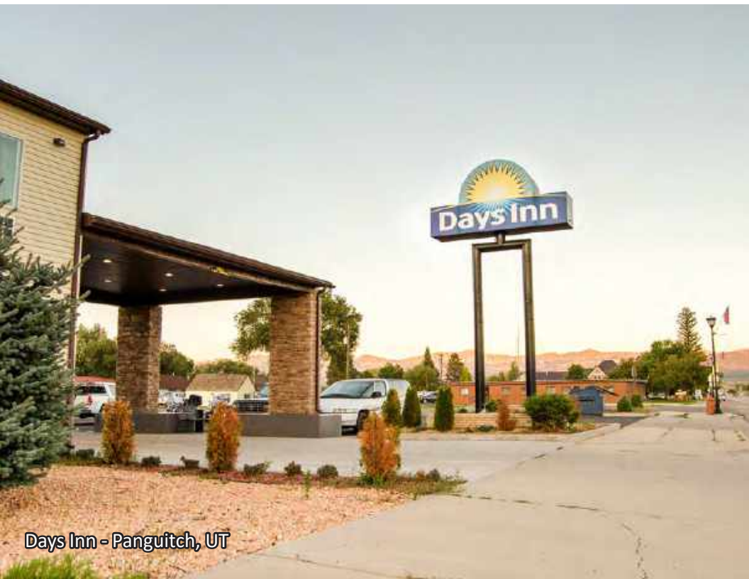
Days Inn - Panguitch, UT