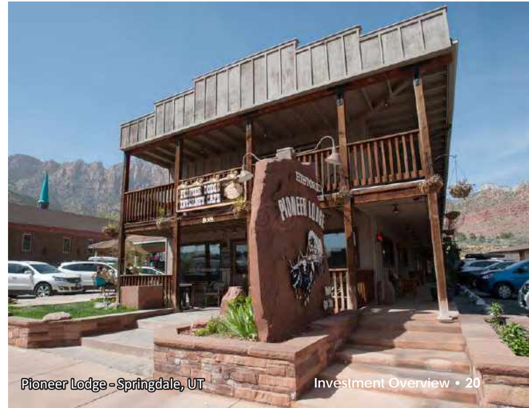
Pioneer Lodge - Springdale, UT