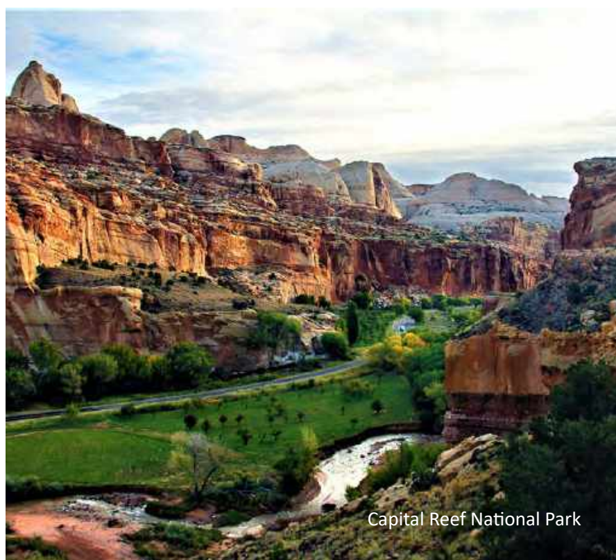
Capital Reef National Park