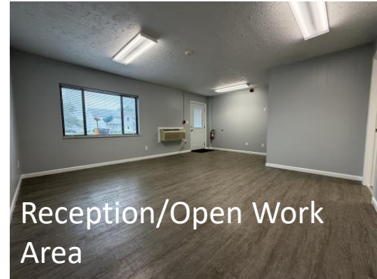
Reception/Open Work Area