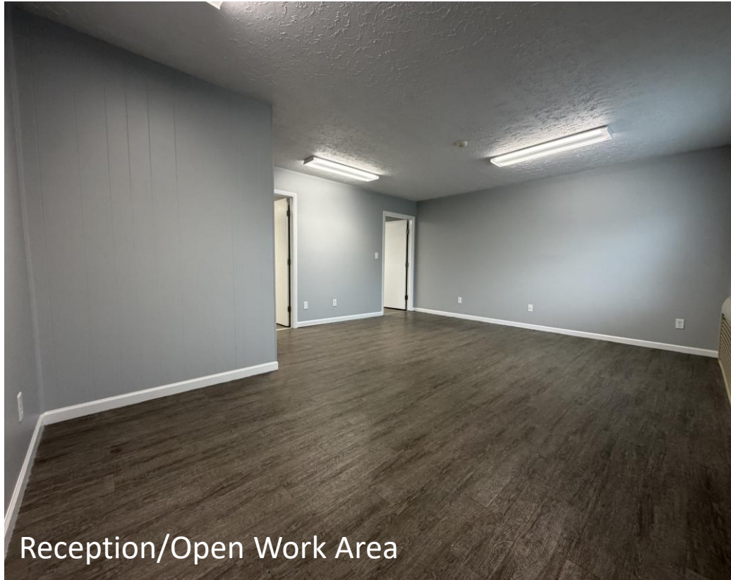
Reception/Open Work Area