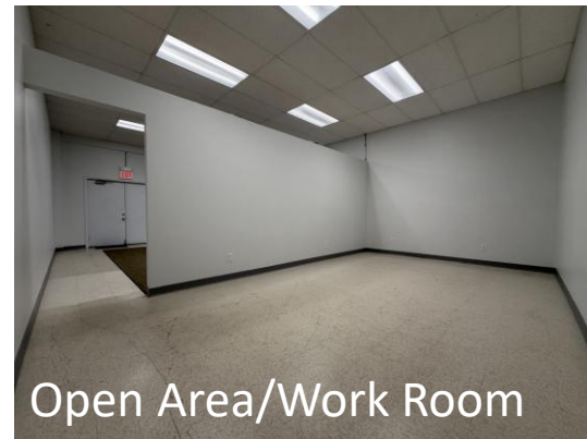
Open Area/Work Room