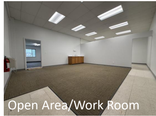
Open Area/Work Room