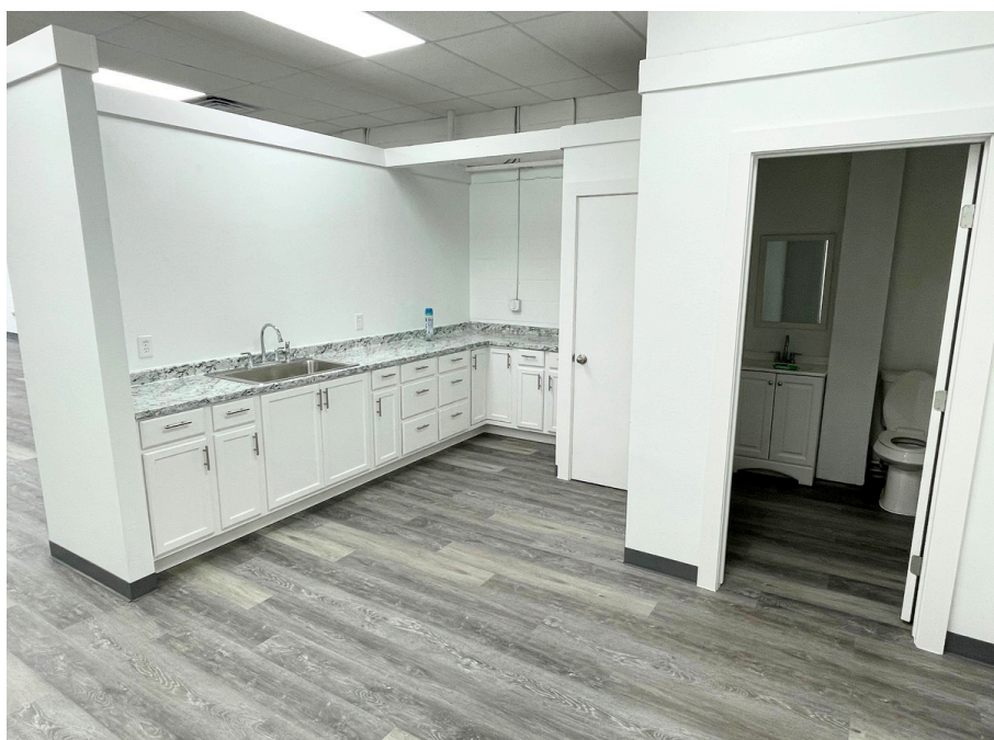
COFFEE BAR - BREAK AREA

4420 W. Vickery Blvd., Suite 200, Fort Worth, TX 76107