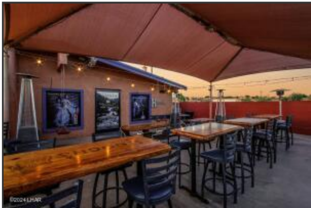
Live Music Front Patio