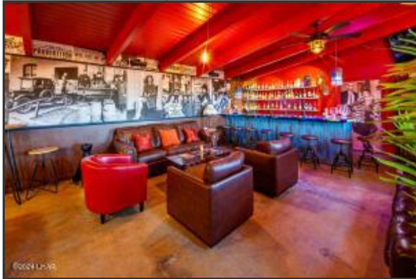
Rent this space for Private Events!