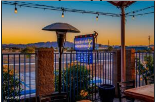
Large Backlit Signage