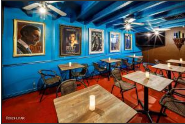
Chill Vibes in the Billiards Room