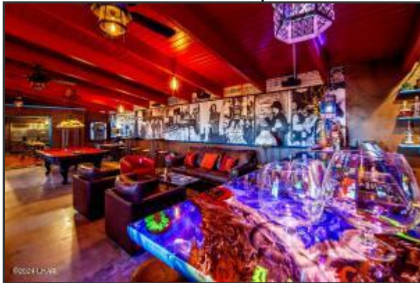
Custom Bar Top