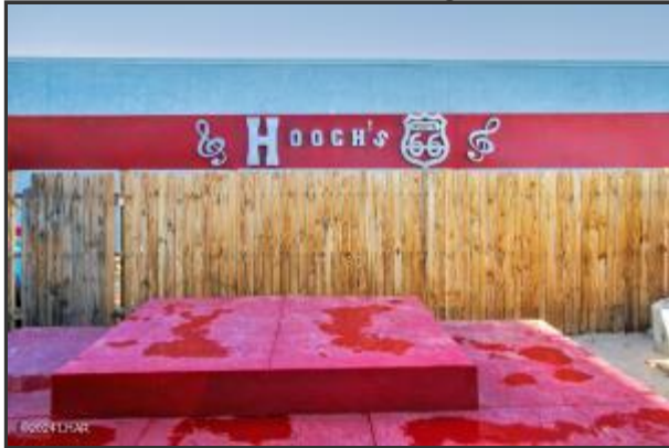
Back Patio Music Stage