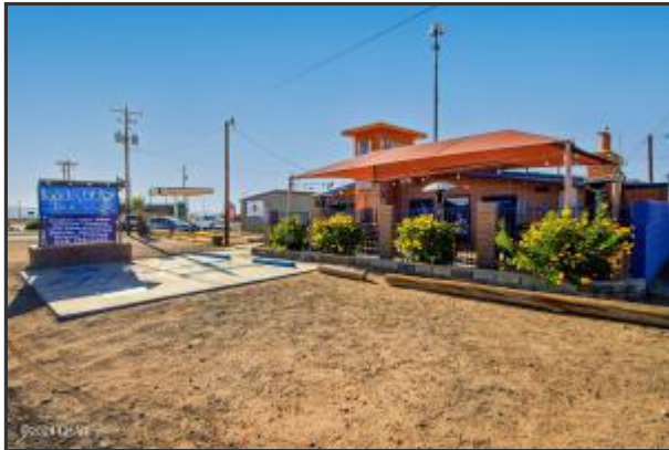
Great Location on Historic Route 66