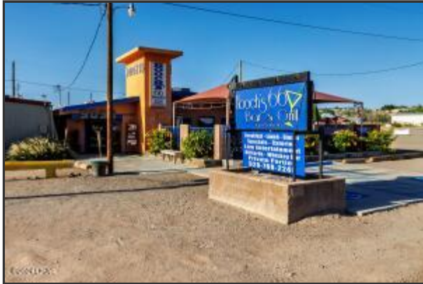
Food, Live Music, Cocktails