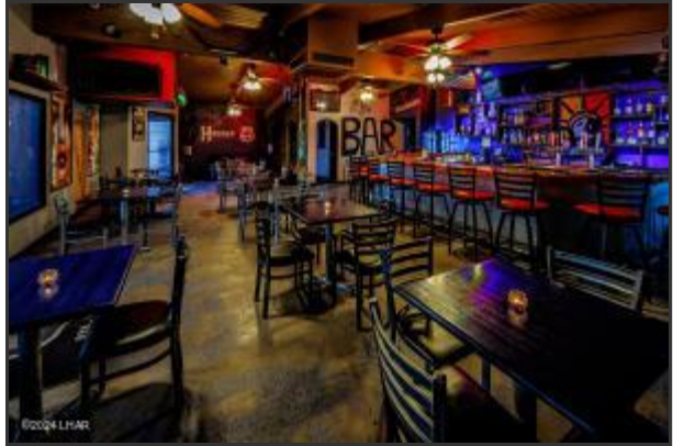
3 Dining Spaces + 2 Patios