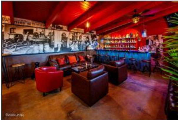
Whisky Bar Area