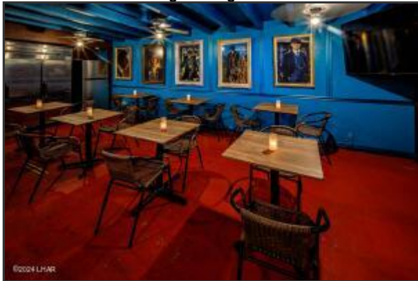
2 Large Dining Rooms