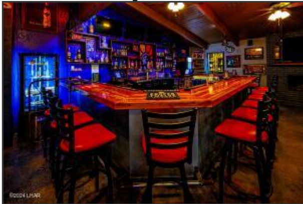
Large Bar Area