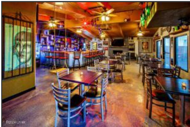
Main Restaurant Bar Area