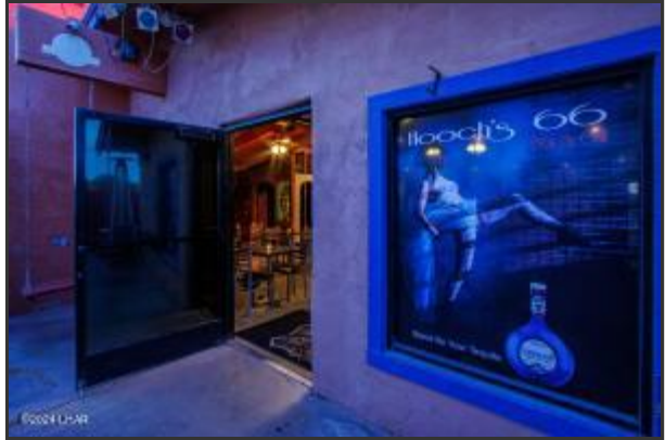
Custom Window Tinting