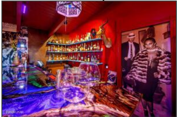
Custom Whisky Bar