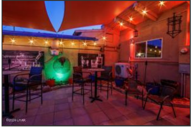
Lots of Outdoor Dining