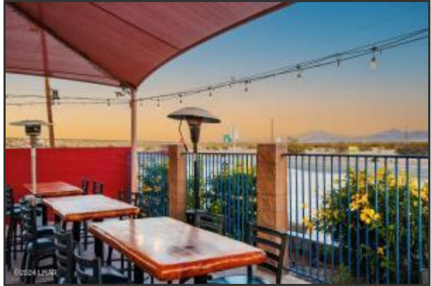
Enjoy the Mountain Views