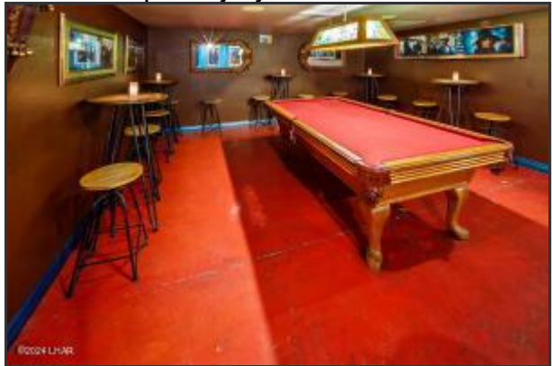
Speakeasy Style Billiards Room