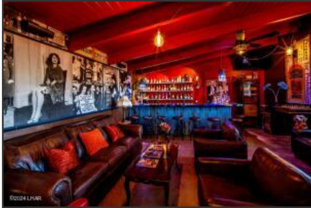
Dining & Bar Area