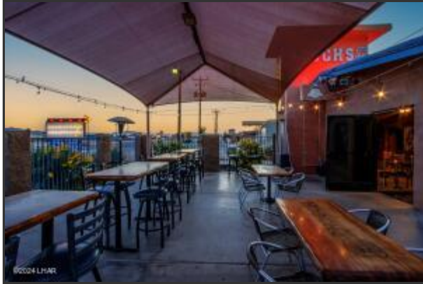
Covered & Heated Patios