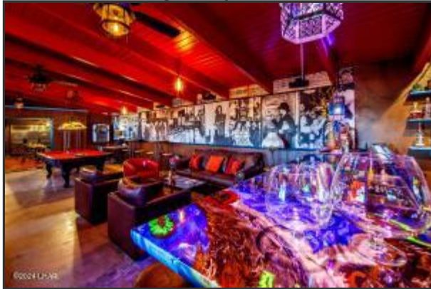
Dining, Whisky & Billiards