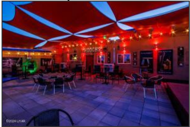
Fully Covered Back Patio