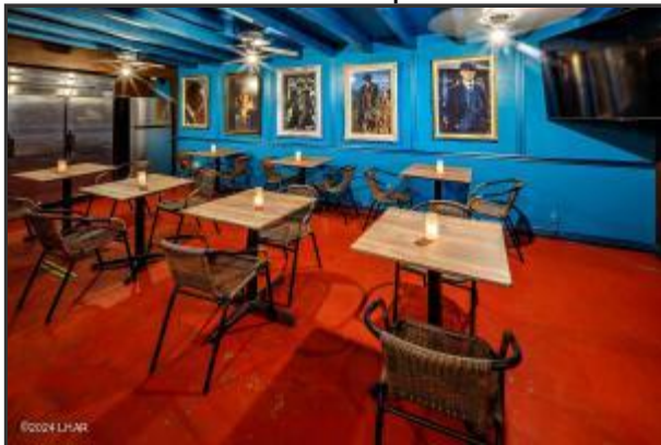
Private Event Space