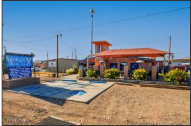
Large Front Patio