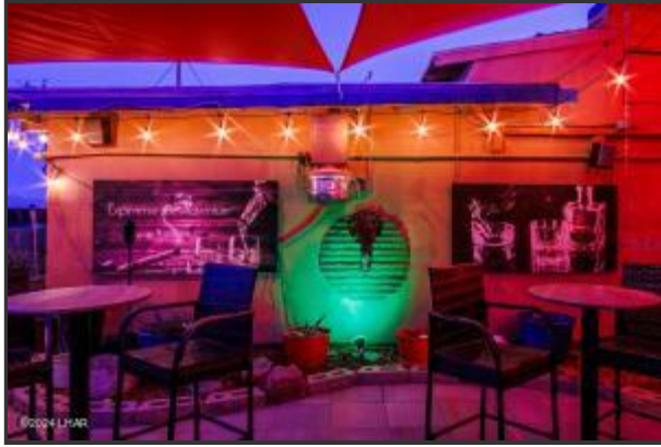
Custom Art All Over the Patio