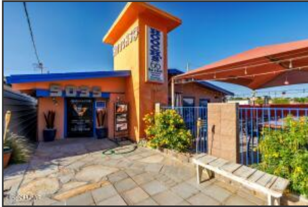
Route 66 Bar & Grill