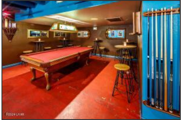
Pool Tables with High Tops Dining