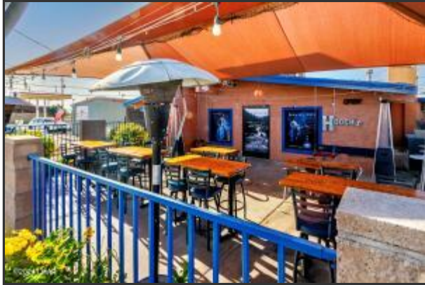
Front Patio with Live Music Area