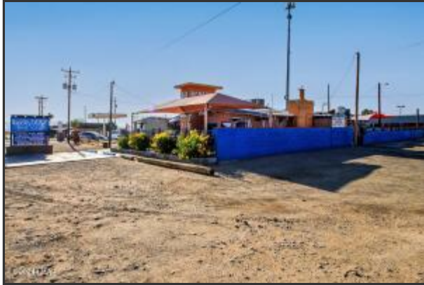
Lots of Parking Available