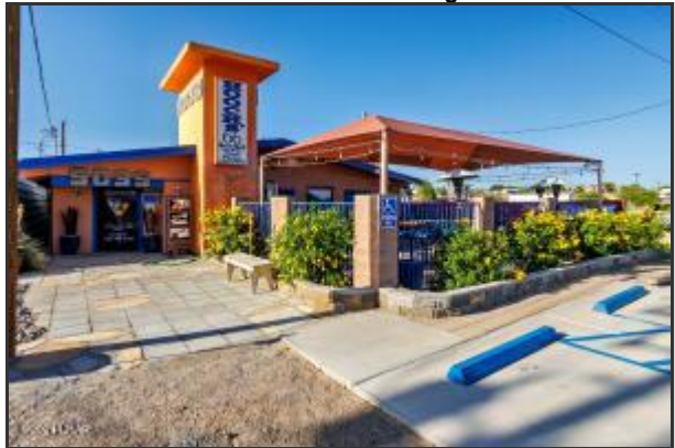
Great Outdoor Dining