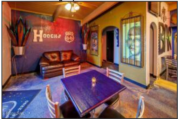
Large Open Front Entrance