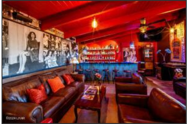
Whisky Bar Dining Room