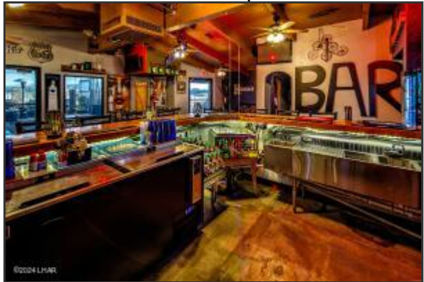
Bar Built For Speed