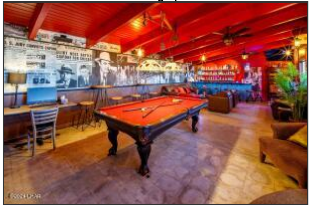
3rd Dining Space