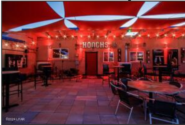
Tons of Outdoor Seating