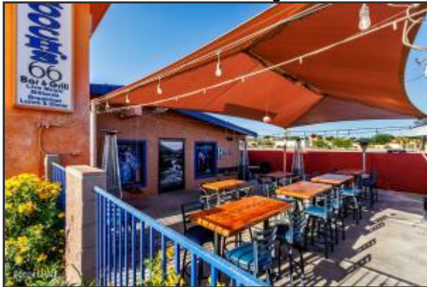
Custom Branded Dining Patio