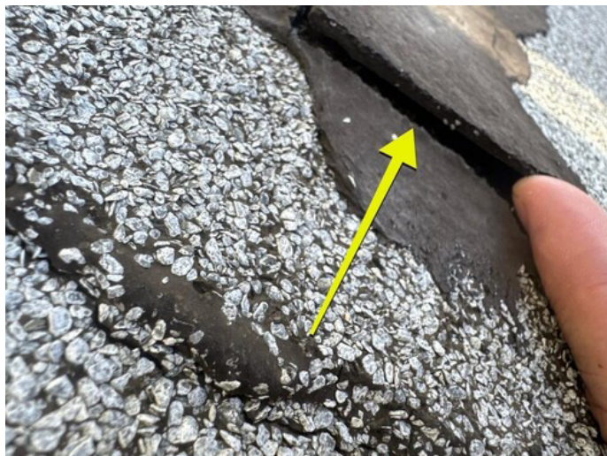
Photo By: Chris Fogg // Project: https://app.companycam.com/projects/98523976