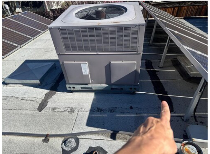
Needs to be resealed