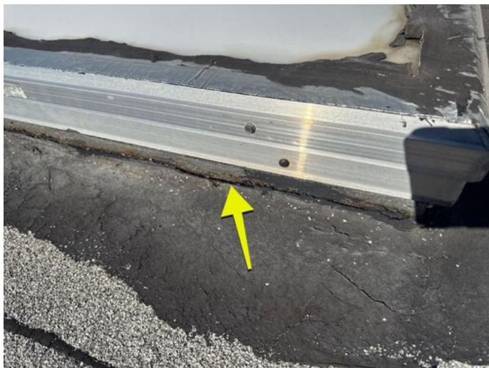
Photo By: Chris Fogg // Project: https://app.companycam.com/projects/98523976