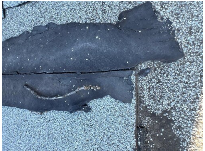
Photo By: Chris Fogg // Project: https://app.companycam.com/projects/98523976