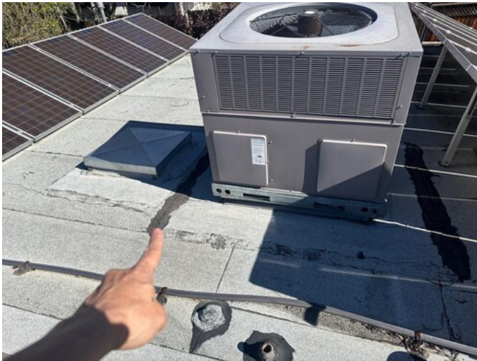
Needs to be resealed