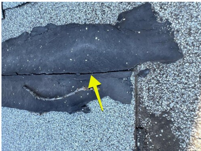
Project: https://app.companycam.com/projects/98523976