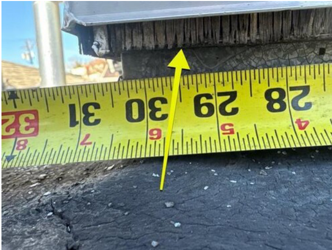
Wood Base needs replaced.