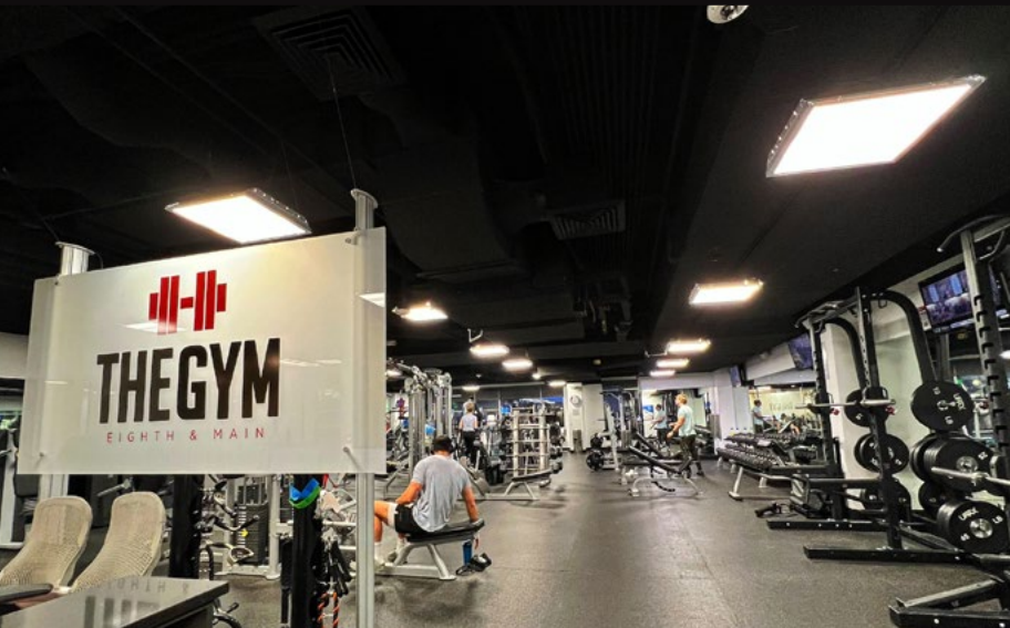
8th & Main Gym