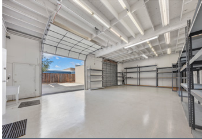
Two large grade level loading doors