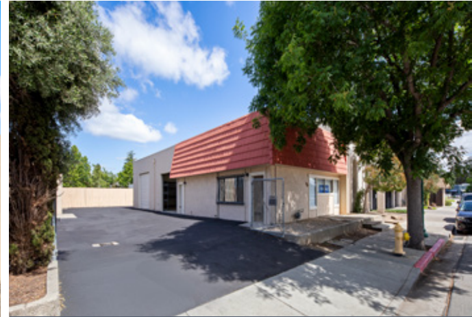
Entrance from Dillon Ave