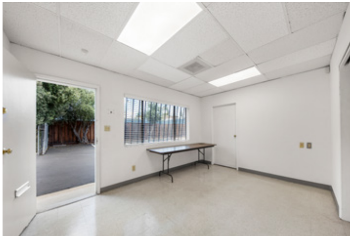
Reception / Lobby