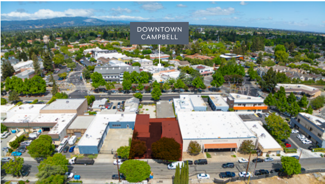
Walking Distance to Downtown Campbell