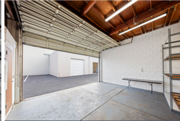
Oversized grade level door in rear shop building