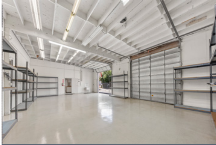
Clearspan Warehouse with VCT Floor