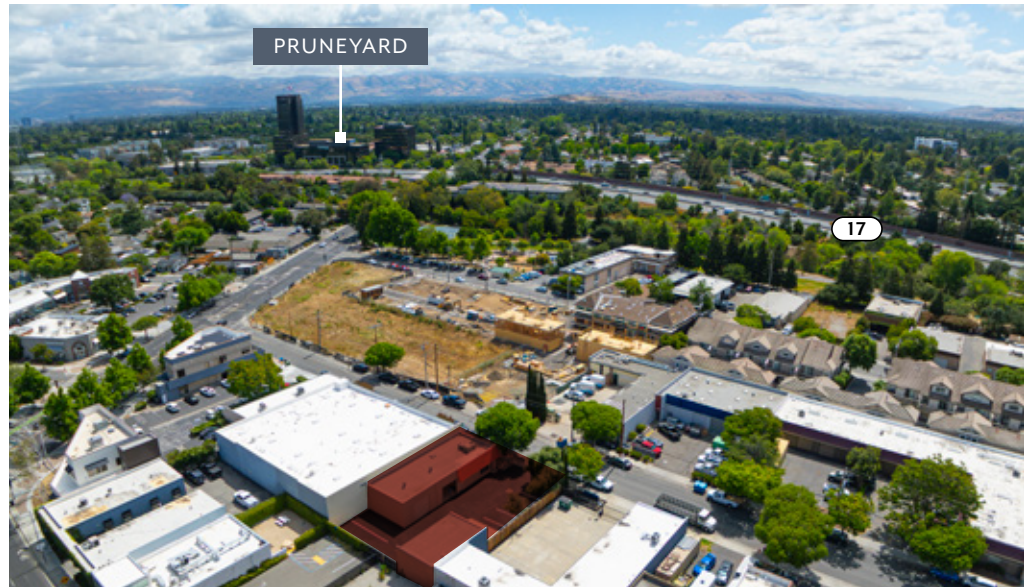
Access to HWY 17 and Pruneyard