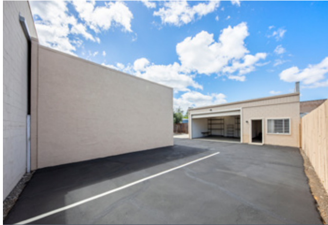
Rear Shop Building and Parking Lot