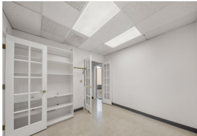
Private office, LED lights