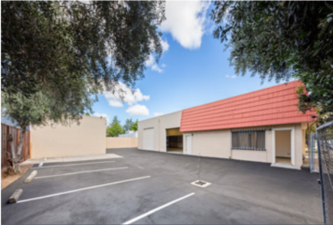
Parking Lot and Main Building