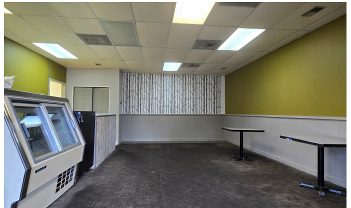
Dining and Service Area