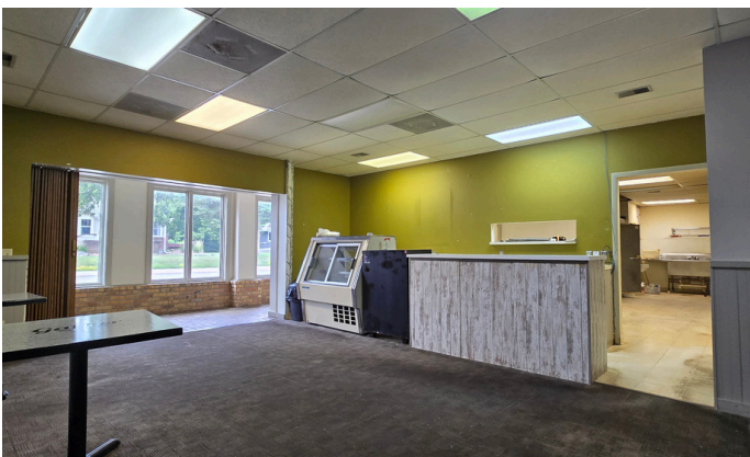
Front Counter / Dining Area