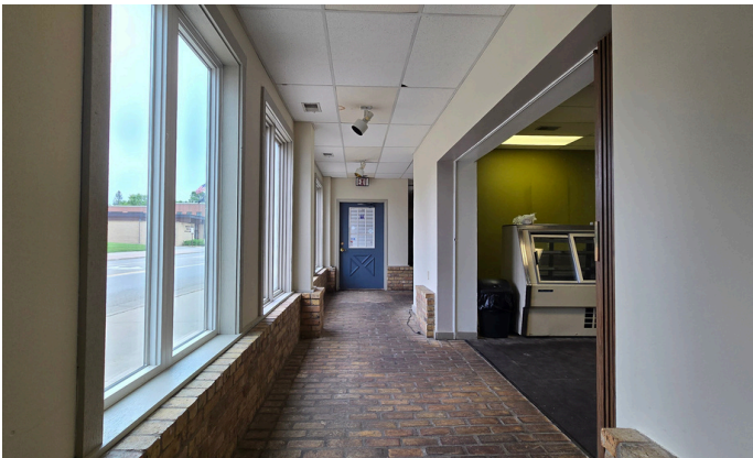
Front Retail / Dining Area