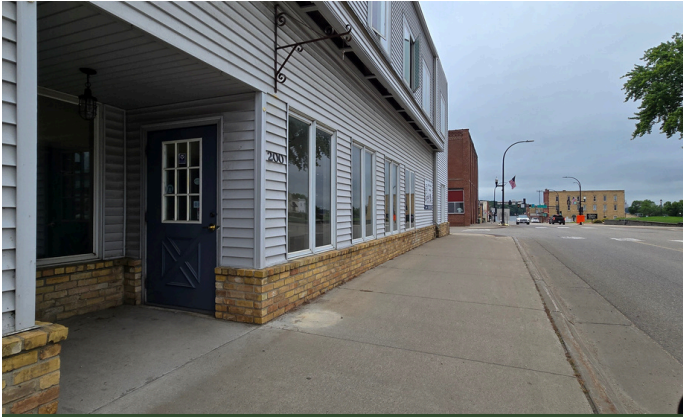
Central Avenue Exterior