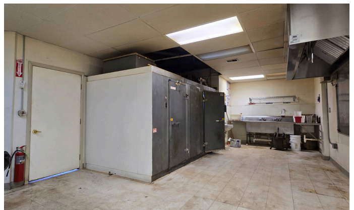
Commercial Kitchen & Walk-In Cooler