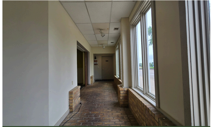
Window-Lined Front Entry